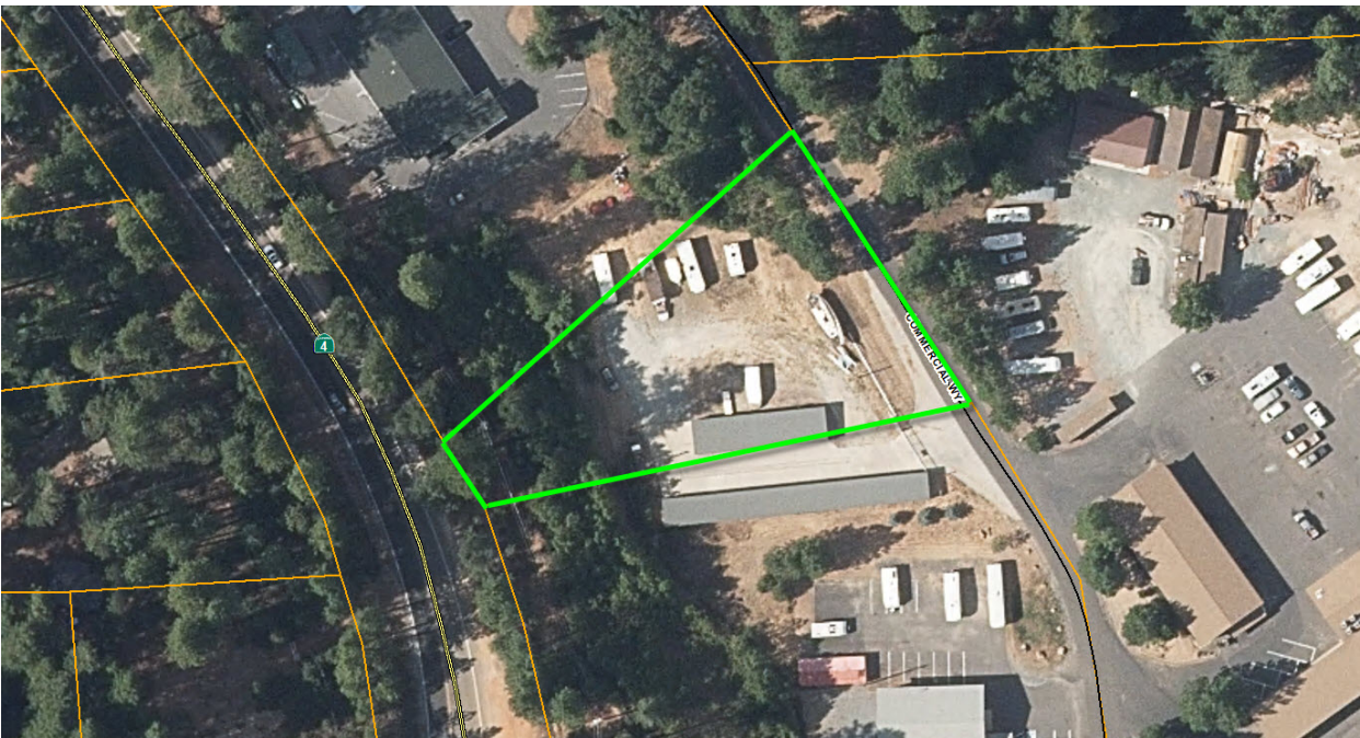
Figure 2- Aerial Photo (Parcel boundary lines shown in green do not reflect the actual location)