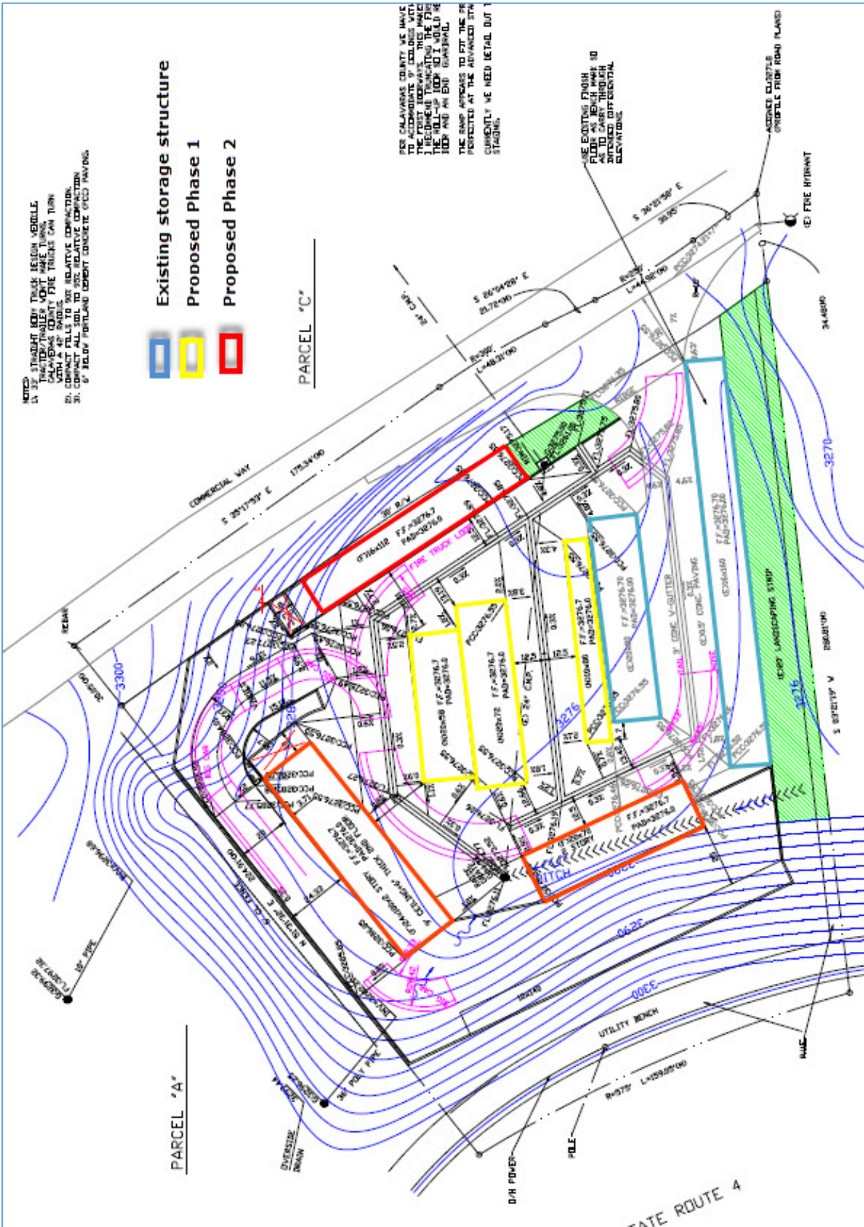
Figure 3- Site Plan