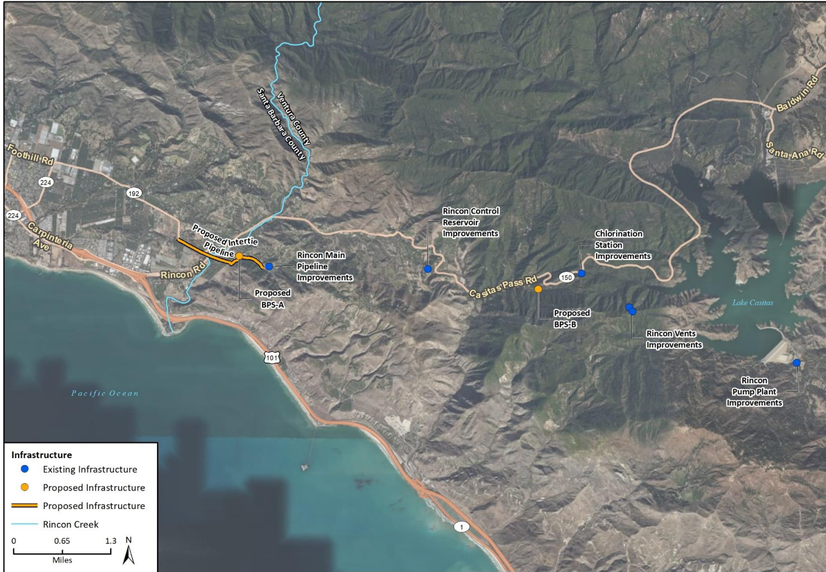
Figure 2 Overview of Project Site