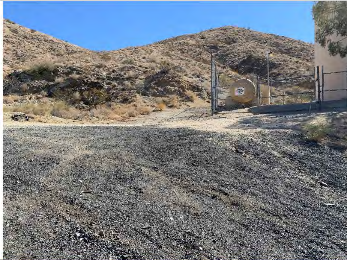
Photo 3. Looking east at the northern edge of the existing reservoir tank and the general location of the new tank.