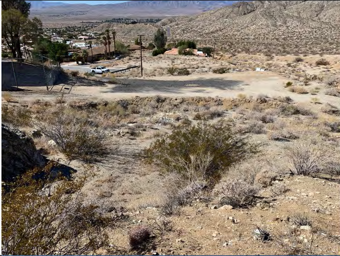
Photo 5. Looking southwest at the general location of the new tank.