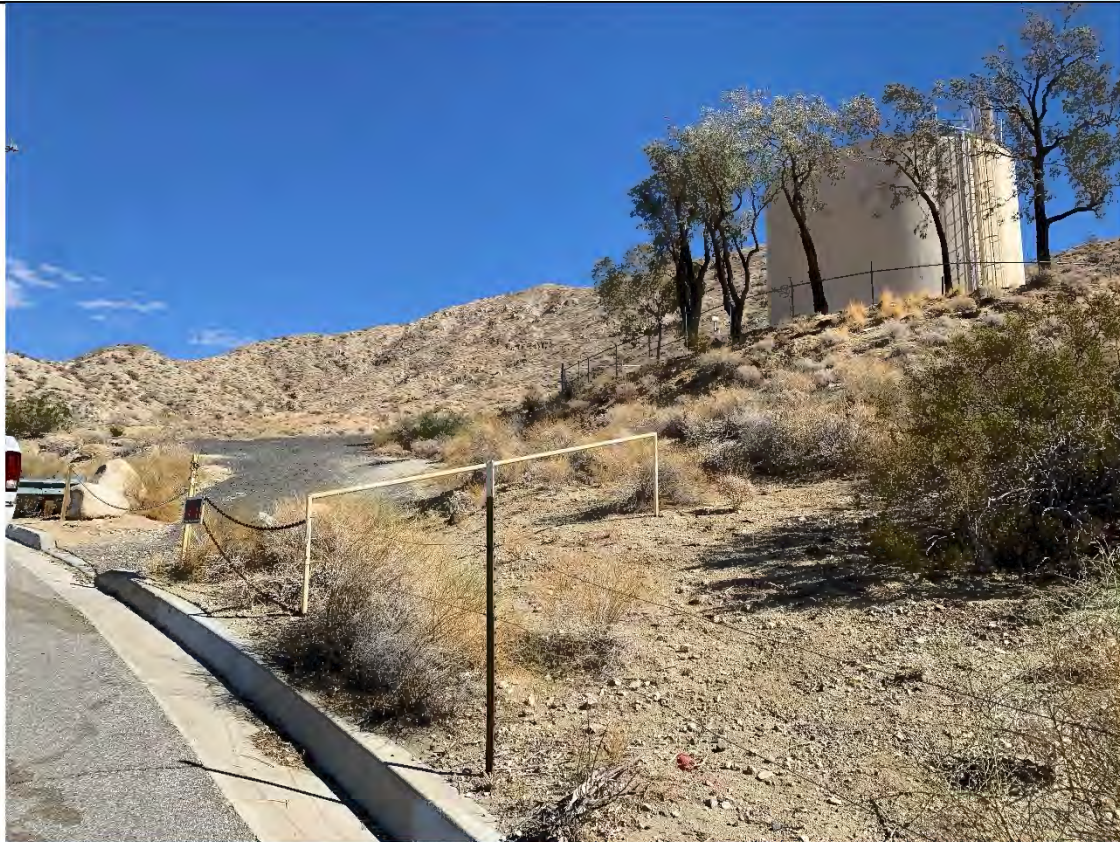
Photo 1. Looking north at the existing reservoir and access road.