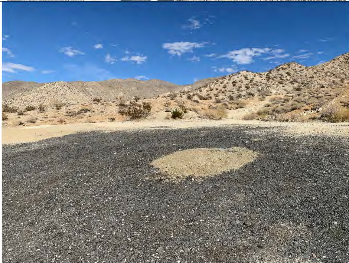
Photo 2. Looking north at existing parking area and general area for the proposed reservoir.