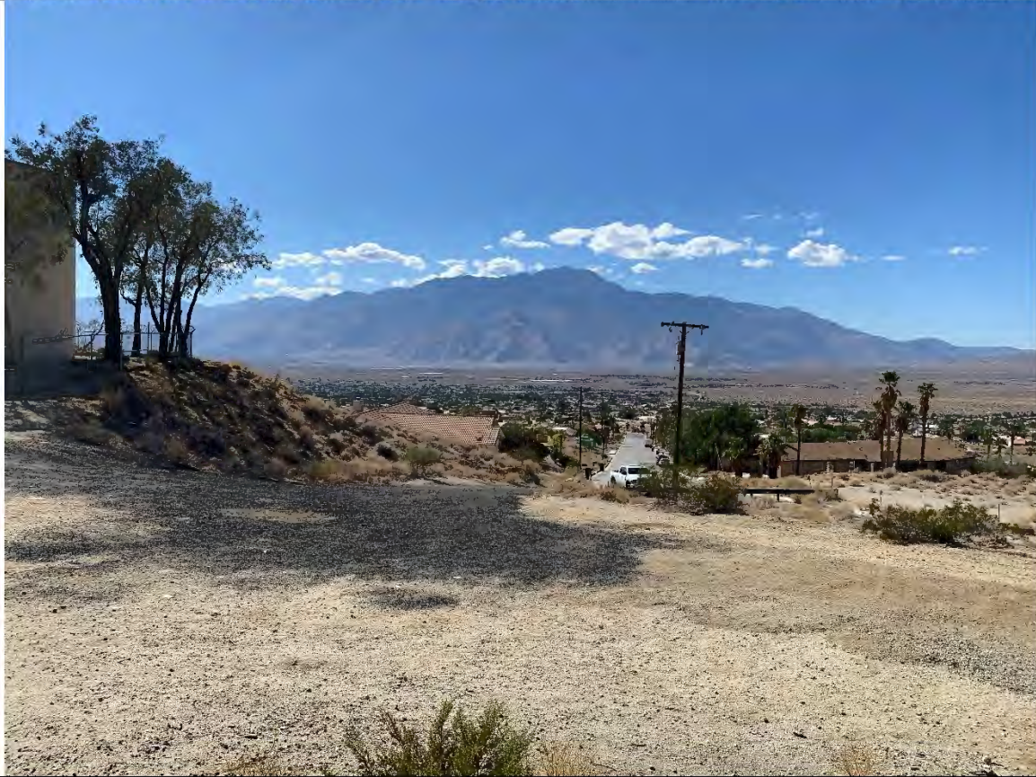
Photo 6. Looking south at the general location of the new tank.