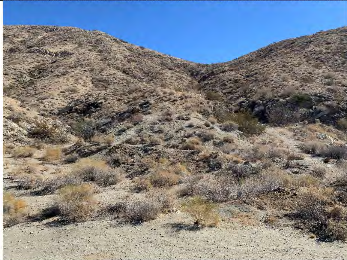
Photo 4. Looking east at the general location of the new tank.