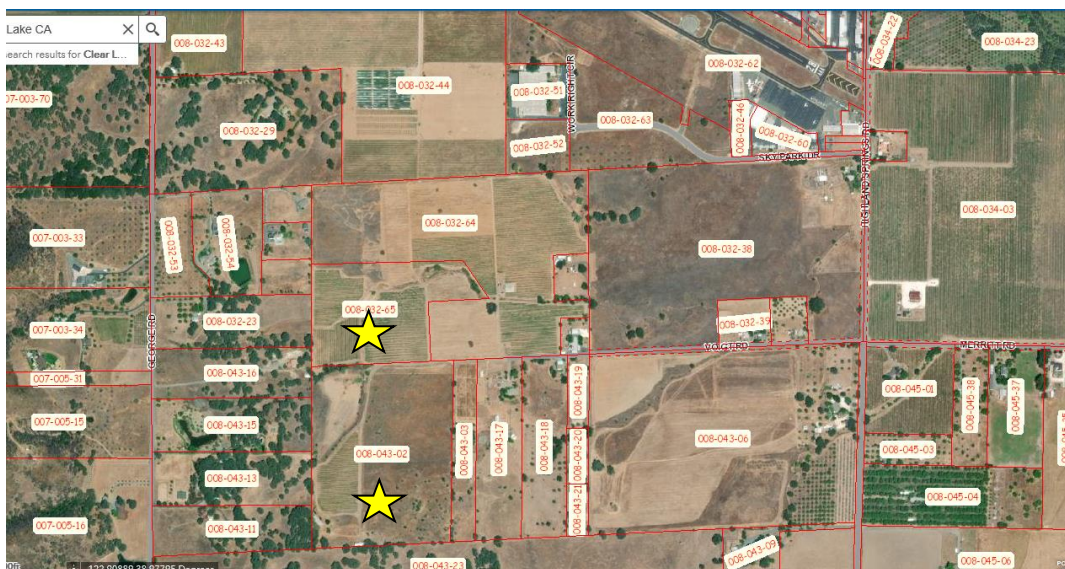
Aerial Photo of Site and Vicinity