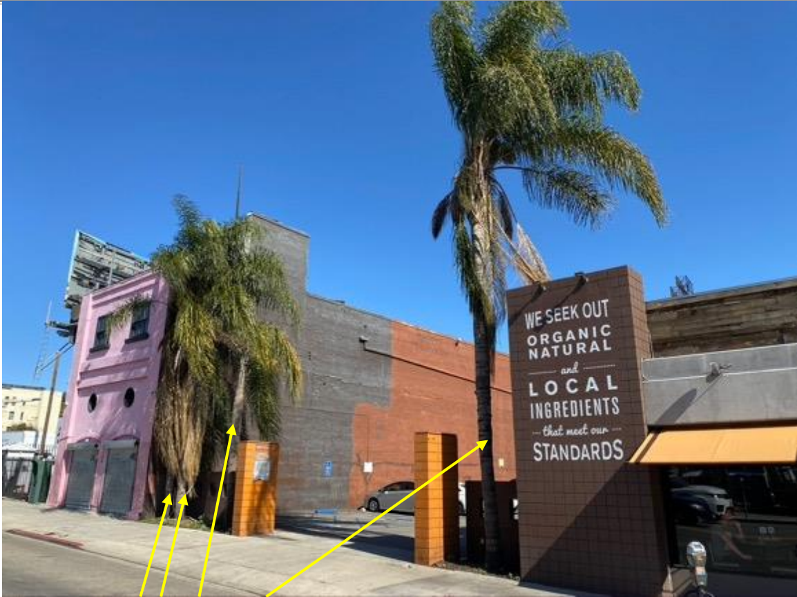
The four (#1, #2, #3, and #4) Queen Palm trees on the Cahuenga Blvd side of the property