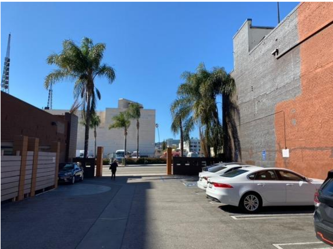
The four Queen Palm trees on the Cahuenga Blvd side of the property