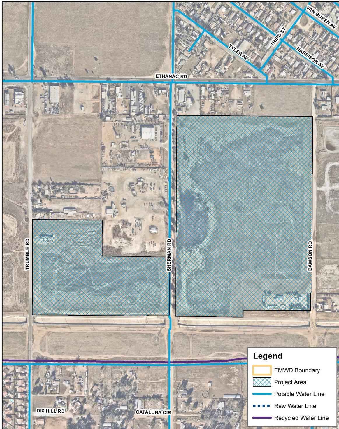
FIGURE 2: PROJECT LOCATION AND EXISTING EMWD WATER LINES