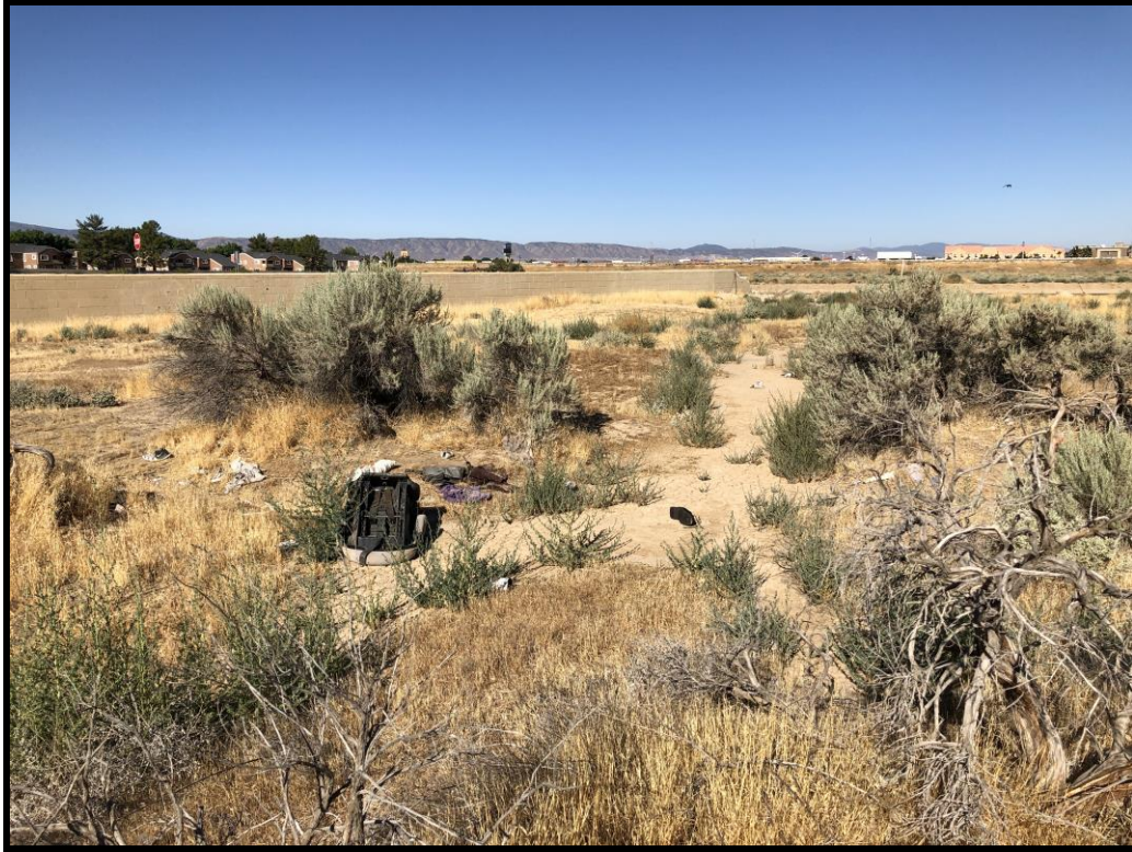
Example of few Great Basin Sage shrubs remaining on site and remnant clay drainage.