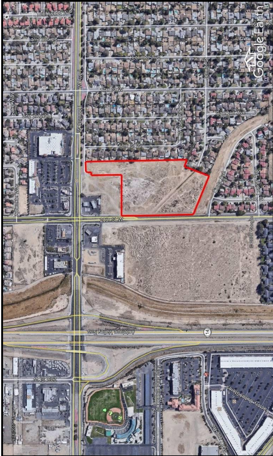
Figure 3. Approximate location of study area showing surrounding land use as depicted on excerpt from Google Earth Aerial Photography, October 2019.