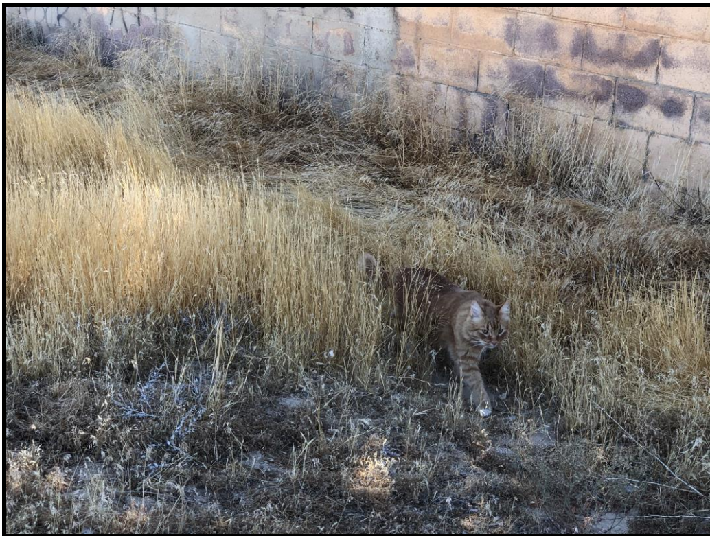
Southeast corner – one of the cats present on site.