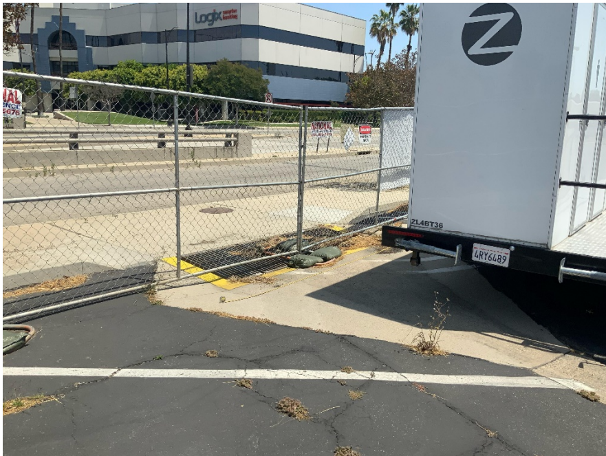
Figure 8 View of west parking lot with 2.5 foot grade rise, View to south

2311 North Hollywood Way SCEA Project D202100195.00