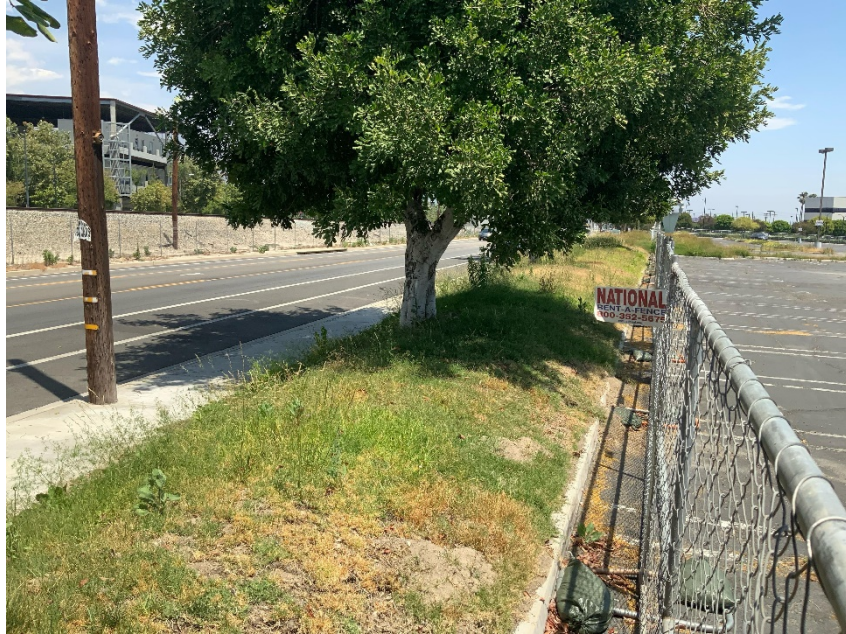
Figure 4 View of electrical utility area between north and east parking lots, View to south

2311 North Hollywood Way SCEA Project D202100195.00