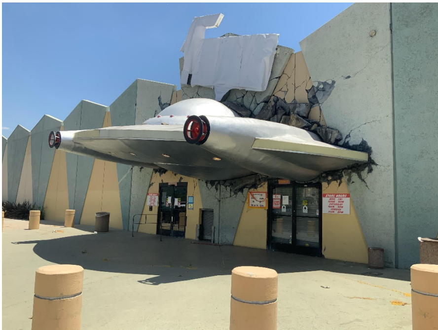
2311 North Hollywood Way SCEA Project