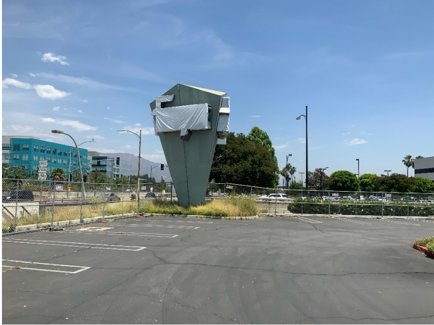
2311 North Hollywood Way SCEA Project