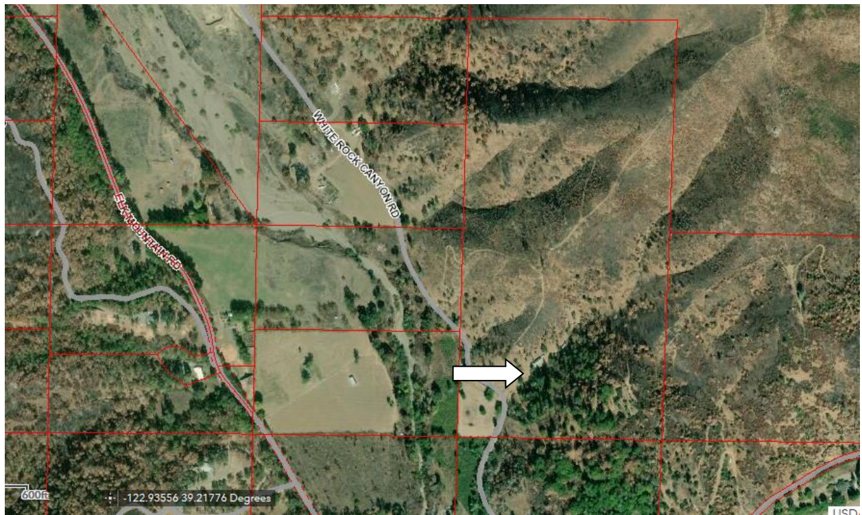
Aerial Photo of Site and Surrounding Properties