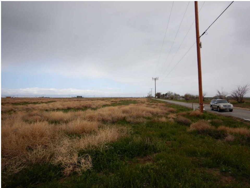
Figure 2-6. Existing Conditions: View of the Northeastern Portion of the Site Looking West along West Avenue A