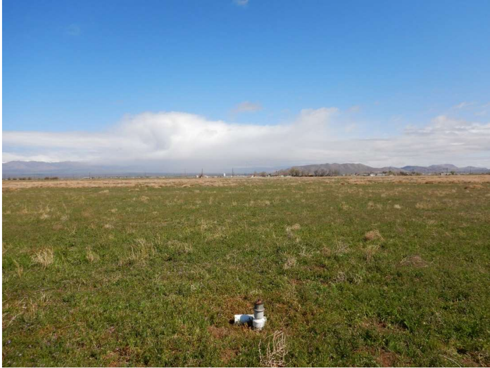
Figure 2-7. Existing Conditions: View of the Central Portion of the Site Looking North