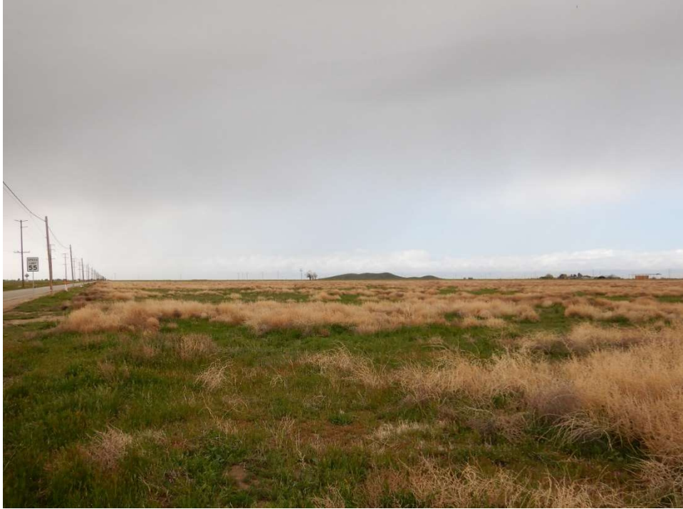
Figure 2-5. Existing Conditions: View of the Northeastern Portion of the Site Looking South along 90 th Street West