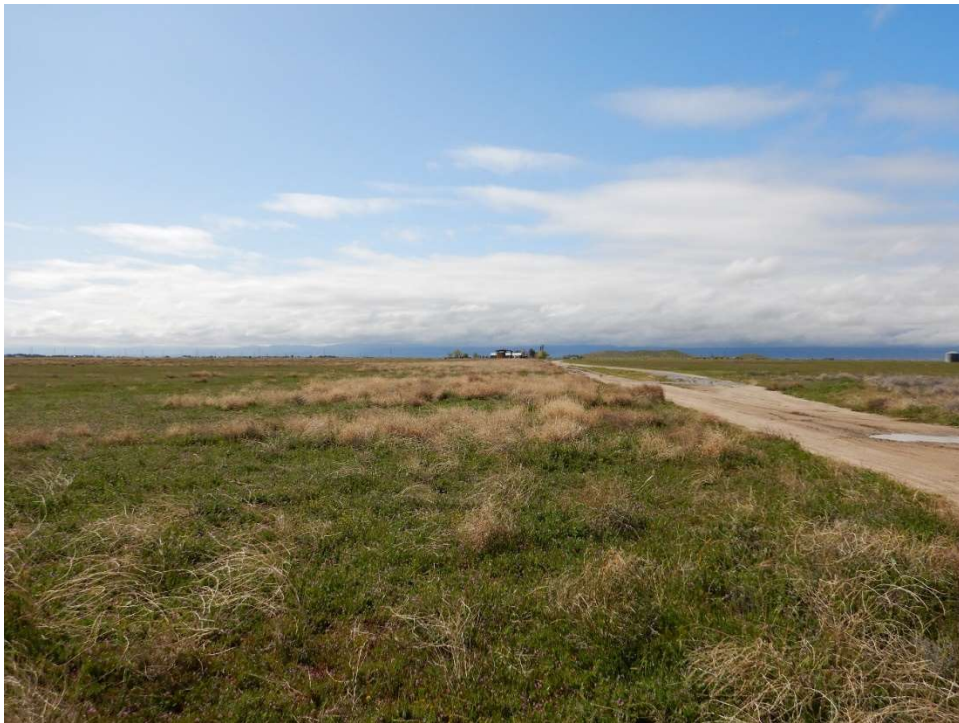
Figure 2-8. Existing Conditions: View of the Northwestern Corner of the Site Looking South along 95 th Street West