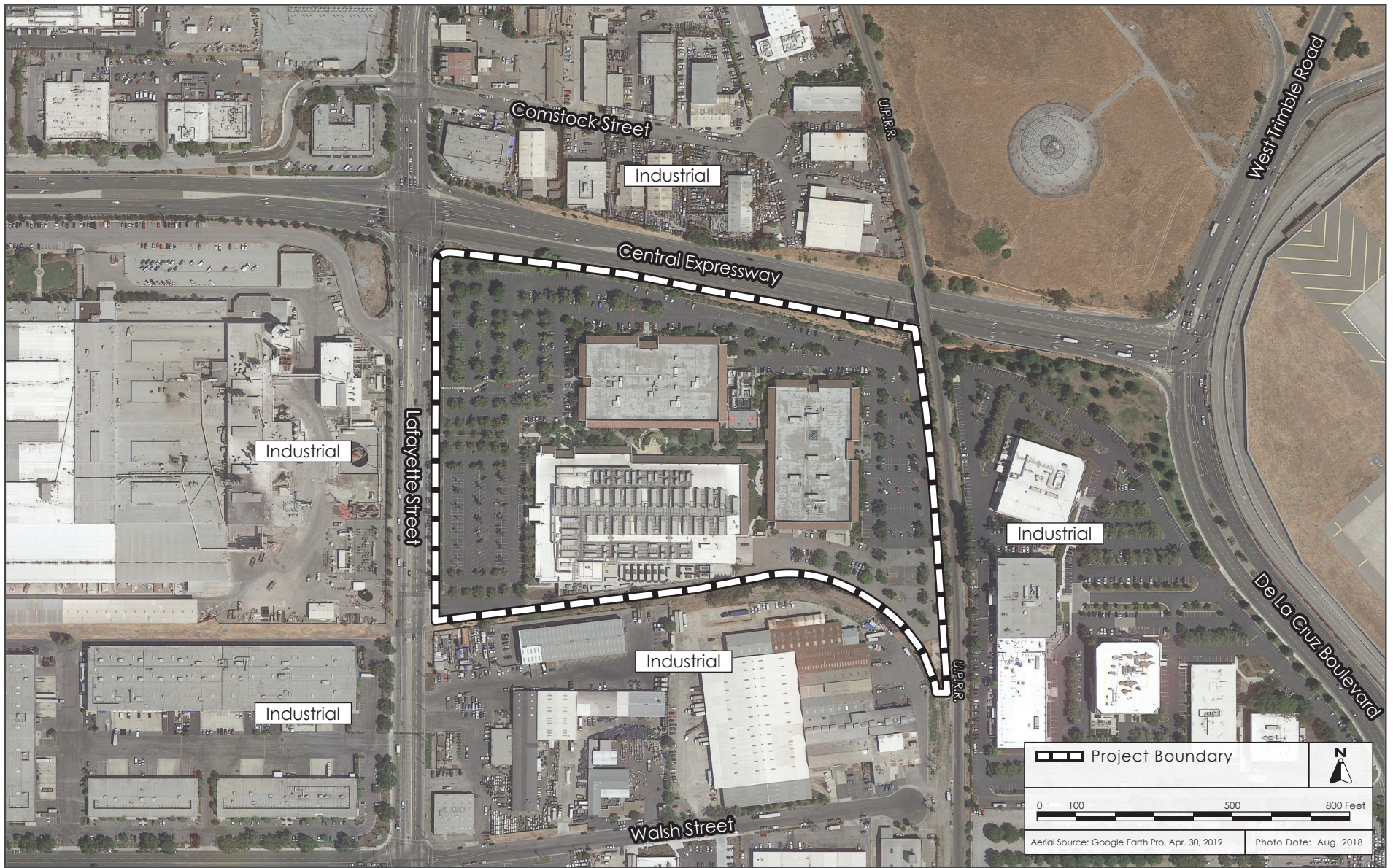
AERIAL PHOTOGRAPH AND SURROUNDING LAND USES