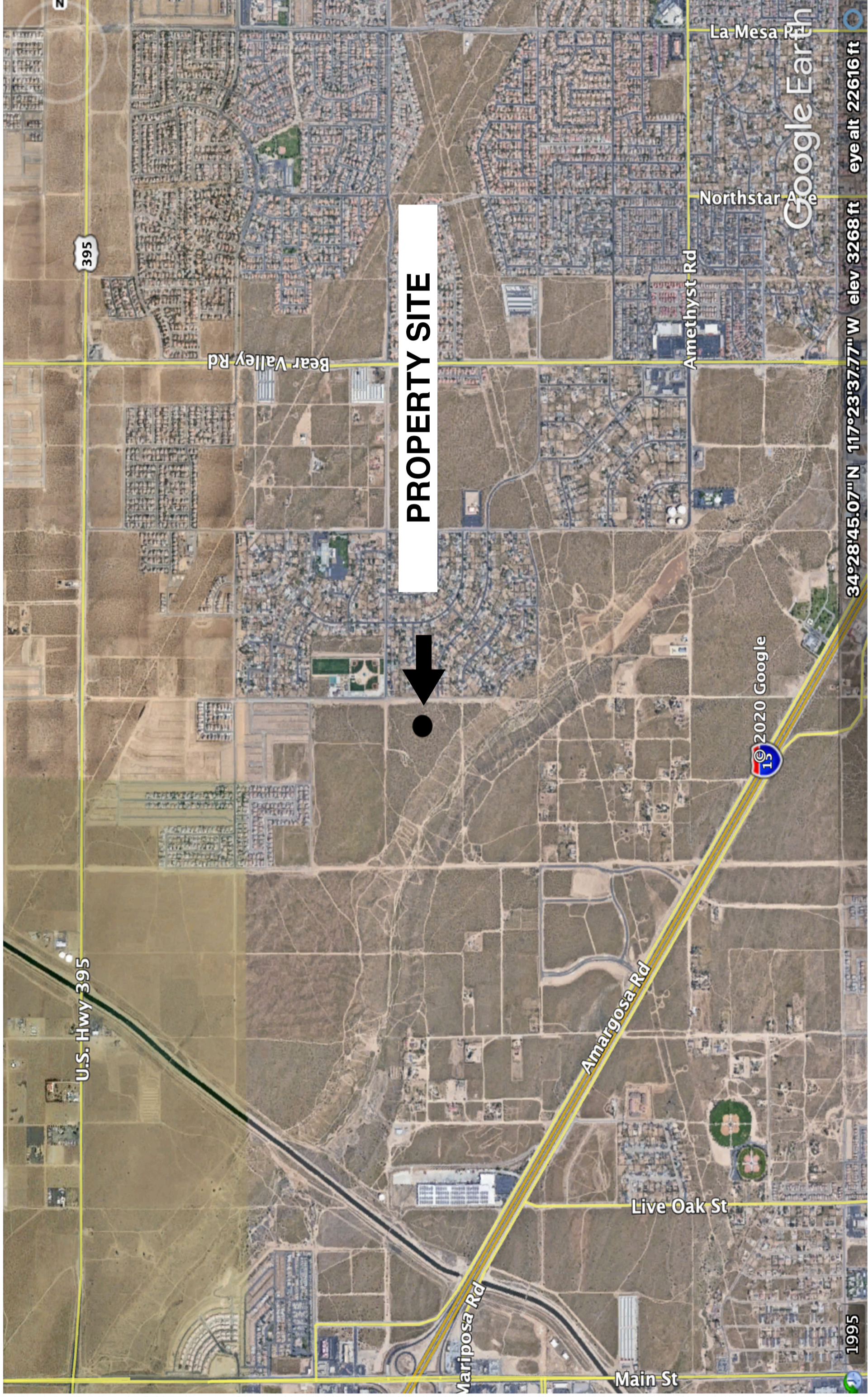
FIGURE 1: REGIONAL EXHIBIT

RCA ASSOCIATES, INC.