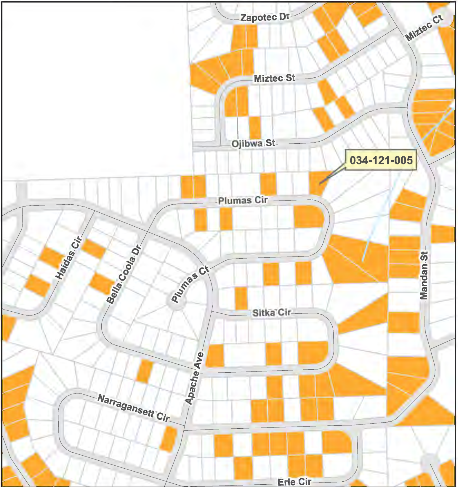
EXHIBIT A Plumas Urban Lot Restoration Project 2