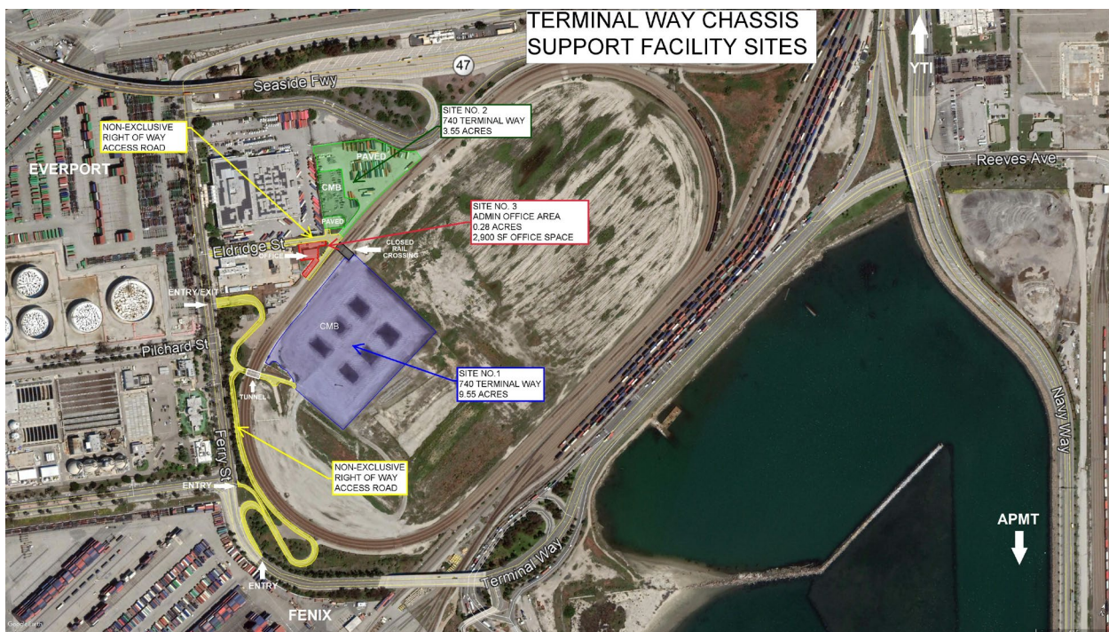
Figure 2. Proposed Project Sites

Construction of the proposed Project would span approximately four months. Construction activities would take place between 7:00 AM through 6:00PM Monday through Friday and as needed between 8:00 AM and 6:00 PM on Saturdays.