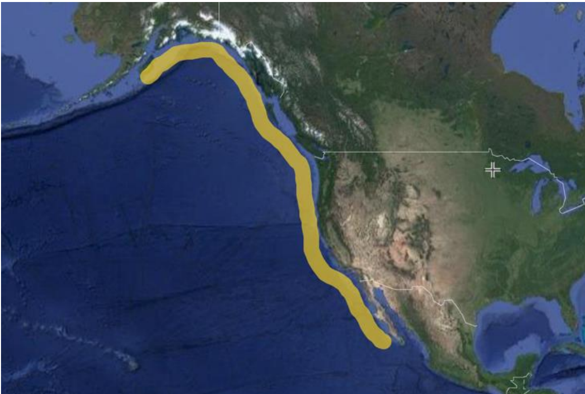
Figure 2. Range of pink shrimp ( Pandalus jordani ).

Pink shrimp ( Pandalus jordani ) is an oceanic shrimp species that range from southeast Alaska down through Baja California (Figure 2). However, they are only abundant enough to support a commercial fishery between British Columbia and Point Arguello, California during most years (Hannah and Jones 2007). As such most fishing activities in California have occurred north of Point Conception. Fishing south of Point Conception can be conducted under a general open access permit, as opposed to a limited-entry one (Title 14, California Code of Regulations (CCR), § 120.2).