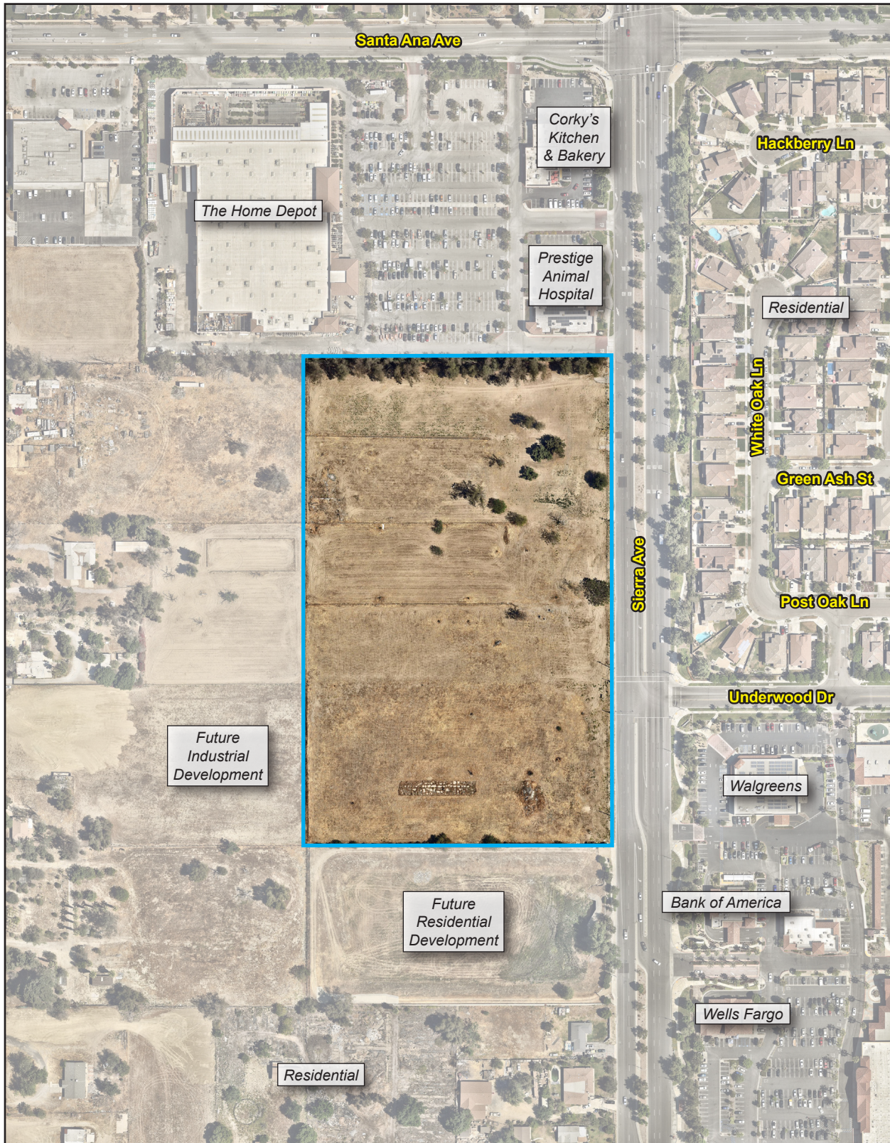
Figure 1 - Local Vicinity