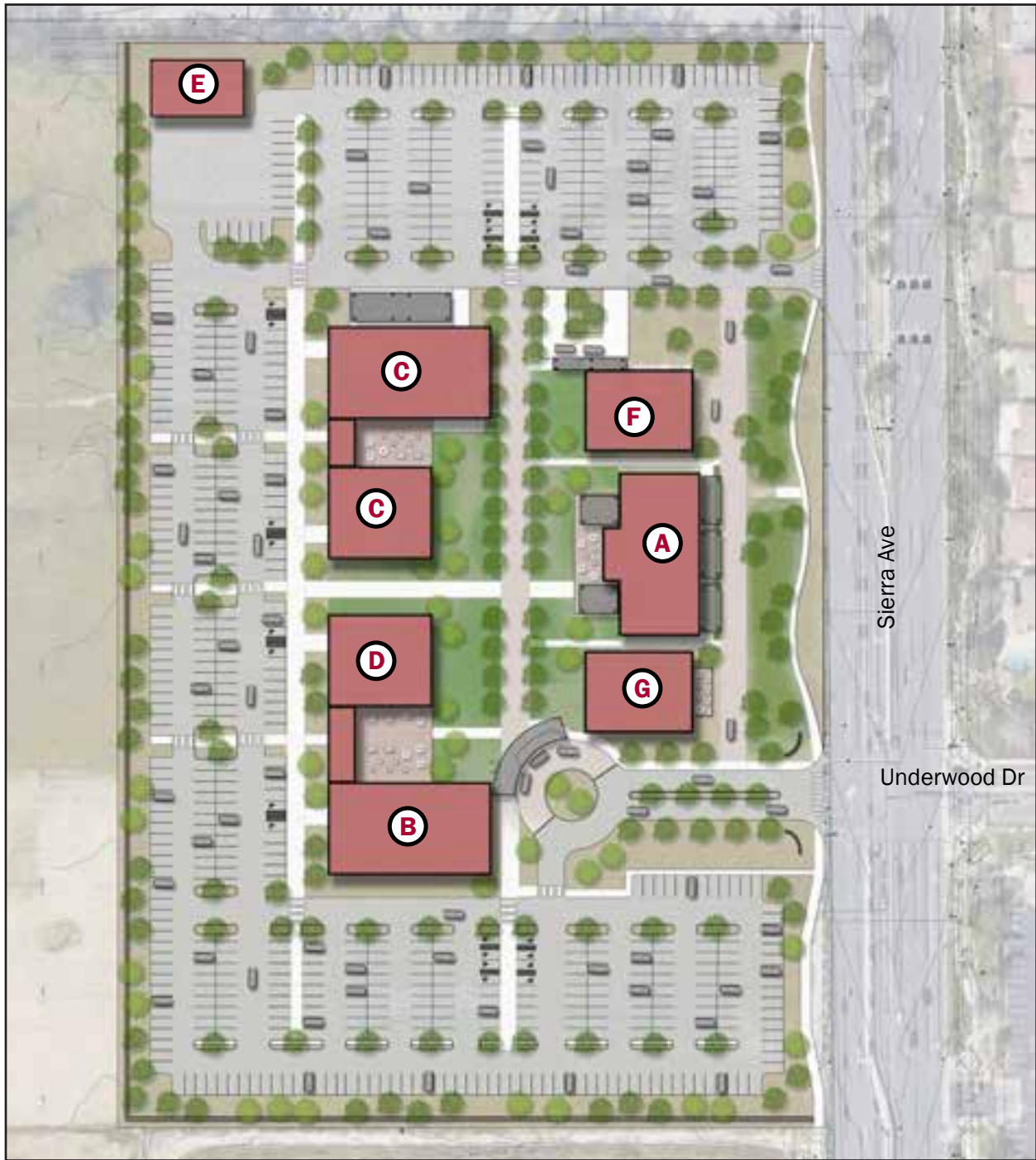
Figure 2 - Proposed Master Plan