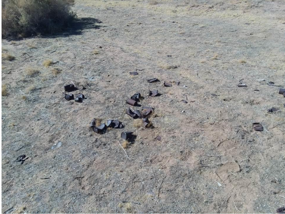
Figure 2 R-1, View towards the Northwest