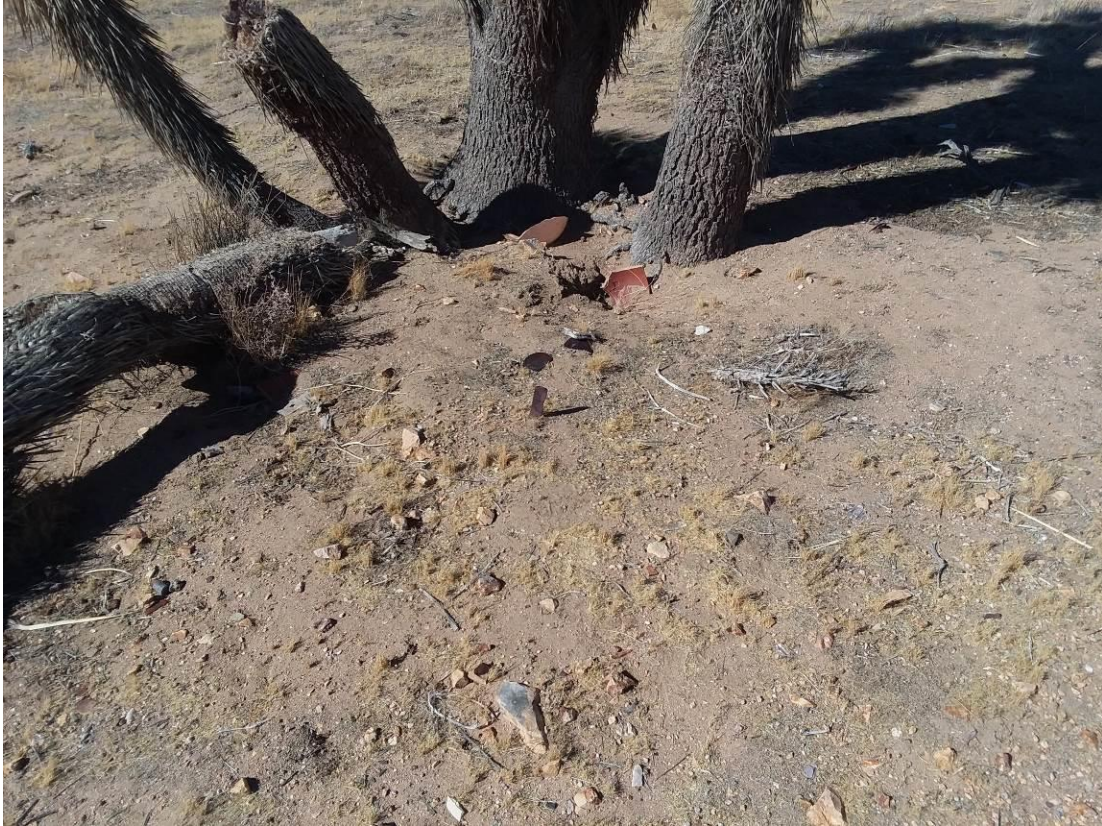
Figure 5 R-1, Trash Scatter, View towards the North