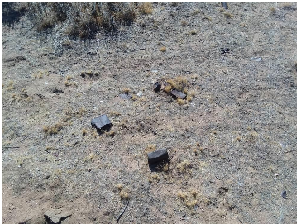
Figure 3 R-1, Trash Scatter, View towards the West