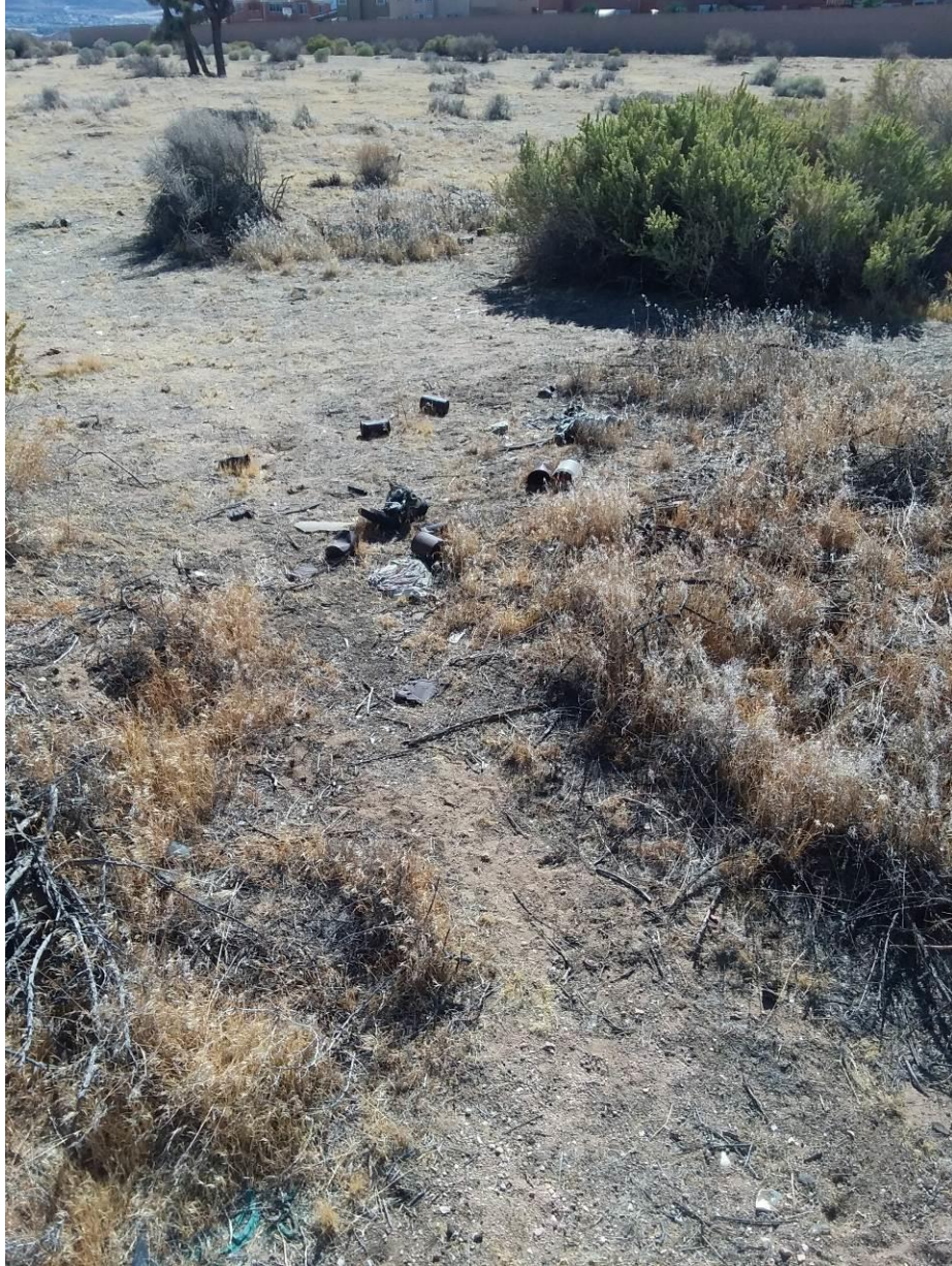
Figure 4 R-1, Trash Scatter, View towards the Southwest