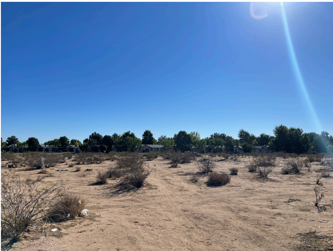
CENTER OF SITE LOOKING EAST