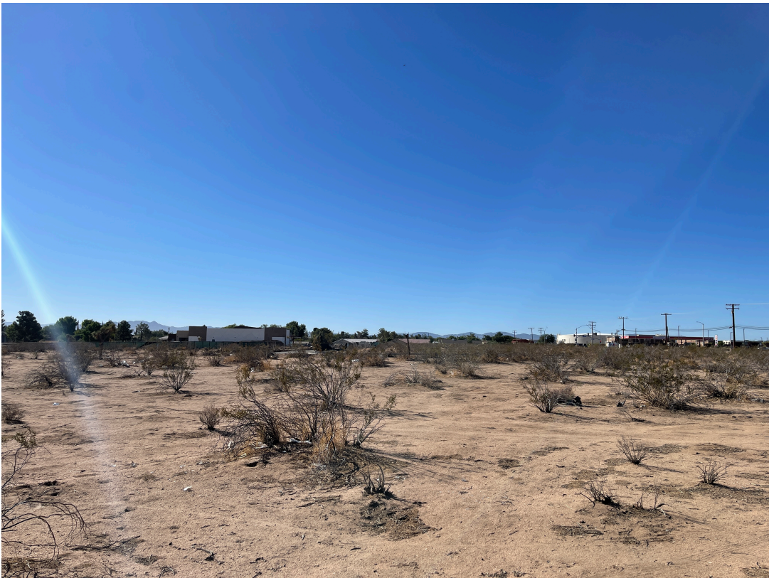
CENTER OF SITE LOOKING SOUTH