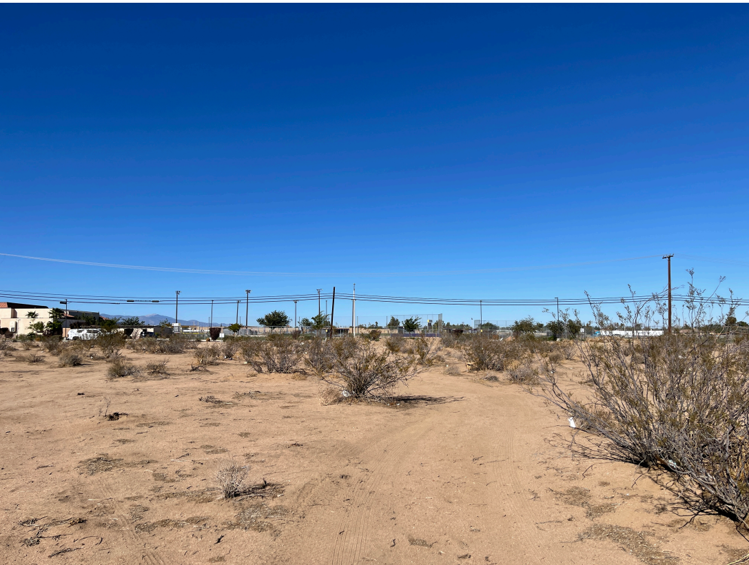
CENTER OF SITE LOOKING WEST