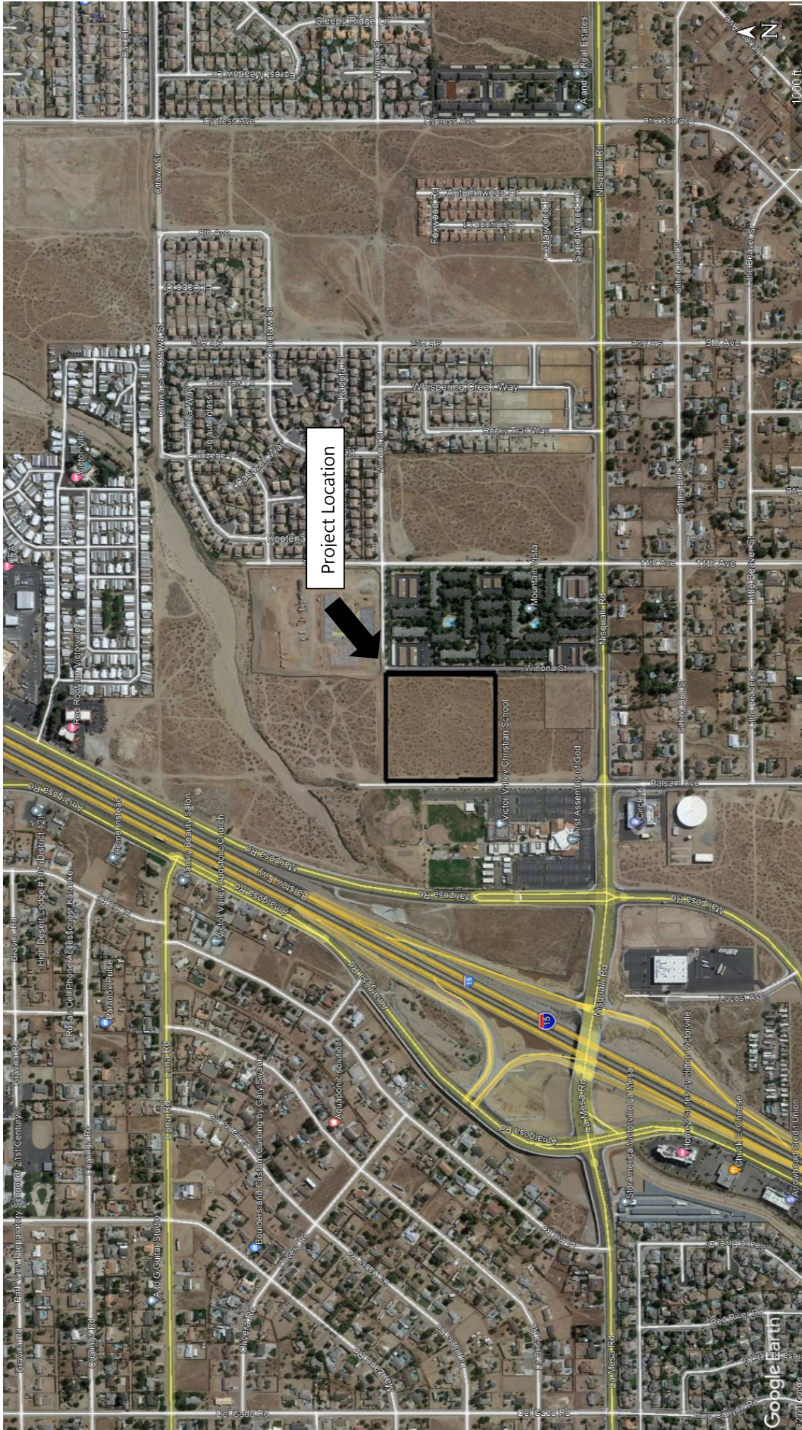
Figure 2: Vicinity Exhibit