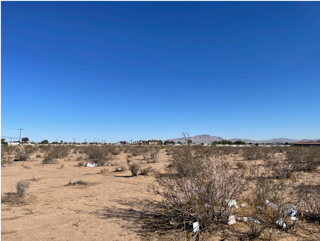
CENTER OF SITE LOOKING NORTH