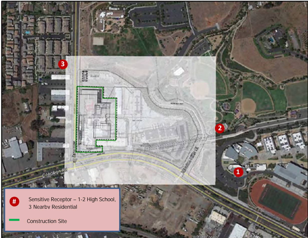
Figure 2: Construction Health Risk Model Setup