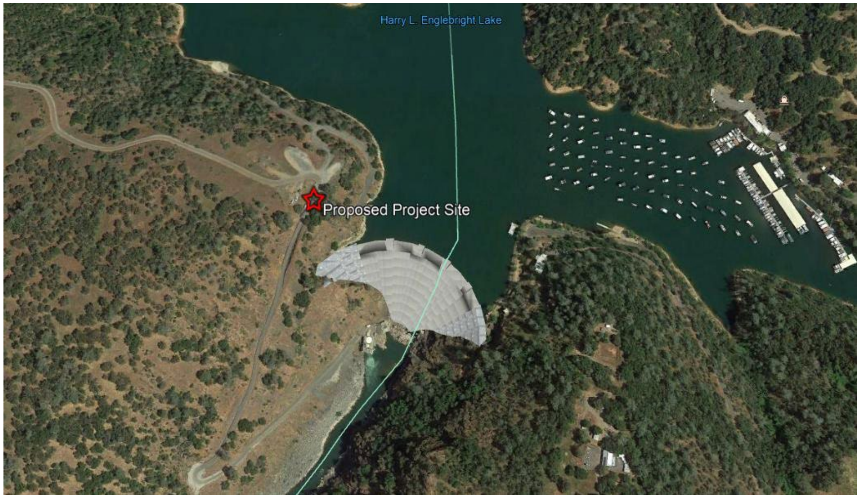
Figure 2. Narrows 2 Generator Back-up GSU Transformer Concrete Pad Project location map.