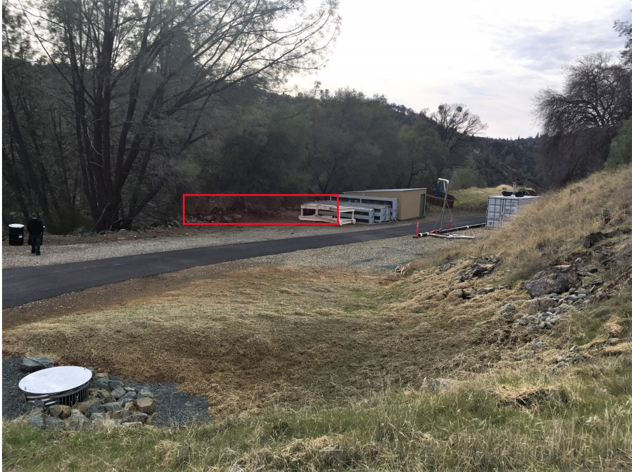
Figure 3. Location of the Back-up GSU Transformer Concrete Pad Project site. The red rectangle shows where the new concrete pad would be placed.