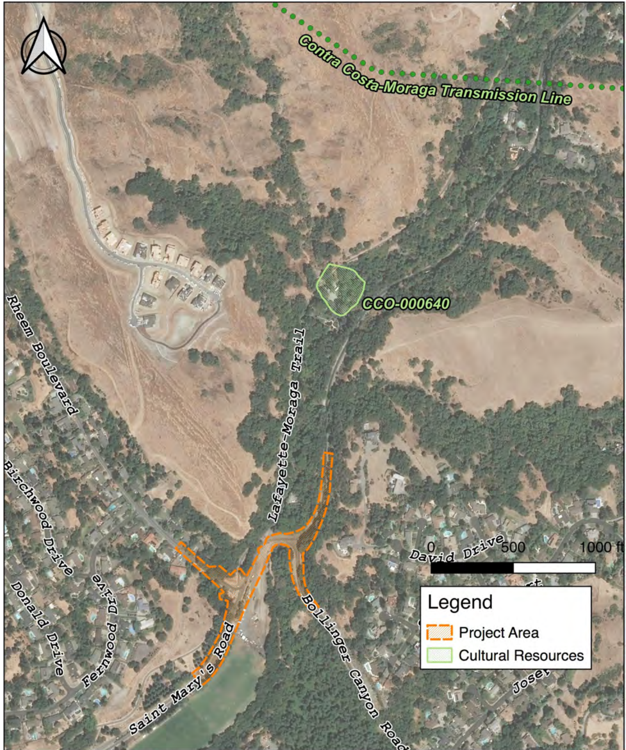
Figure 4: Cultural Resources in Project Vicinity