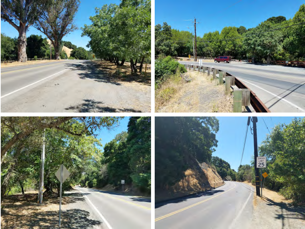
Figure 5: Survey Area

Upper right: St. Mary's Road, looking north toward intersection with Rheem Boulevard