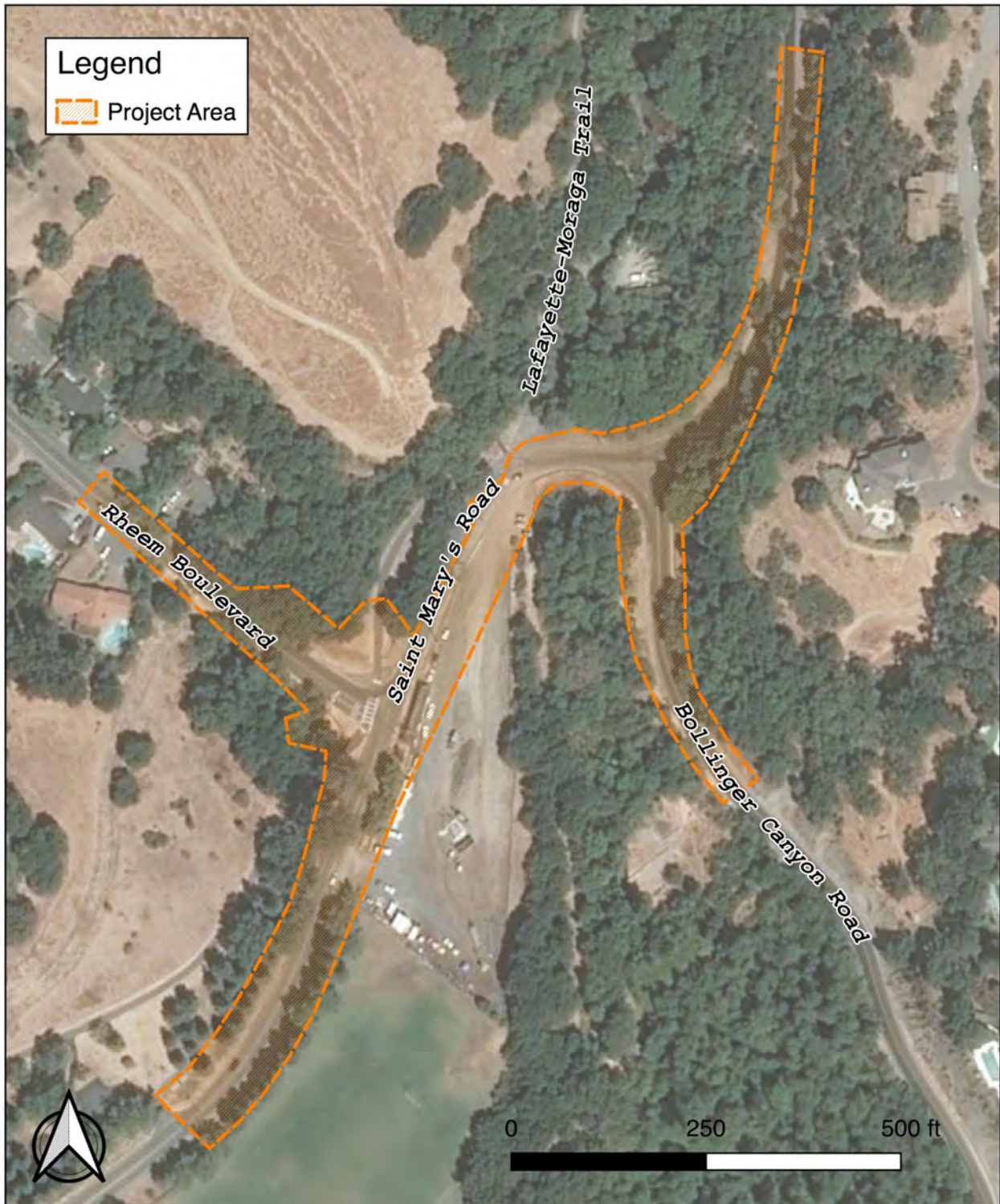
Figure 3: Project Area Map