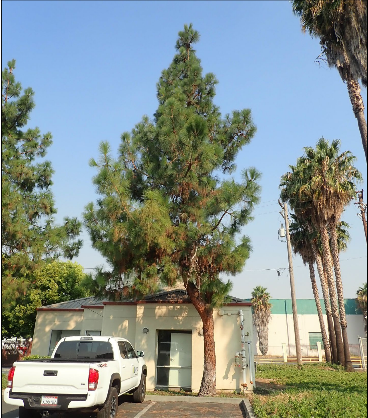
Photograph 2. Tree #114, a 48.7" circumference Canary Island pine ( Pinus canariensis ) ordinance-size tree in the northern portion of the Project Area.