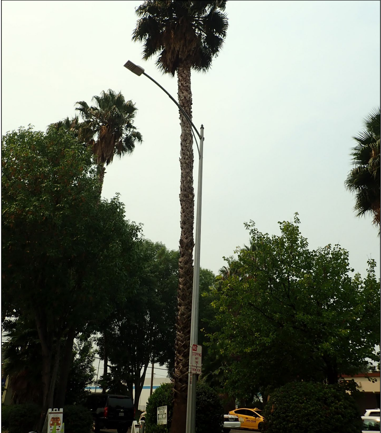
Photograph 5. Tree #189, a 59.3" circumference Mexican fan palm ( Washingtonia robusta ) ordinance-size tree along Las Plumas Avenue.