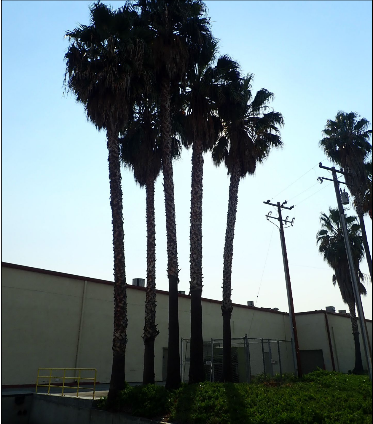
Photograph 3. Tree #'s 117, 118, 119, 120, and 121 in the northern portion of the Project Area. All trees are considered ordinance-size trees.