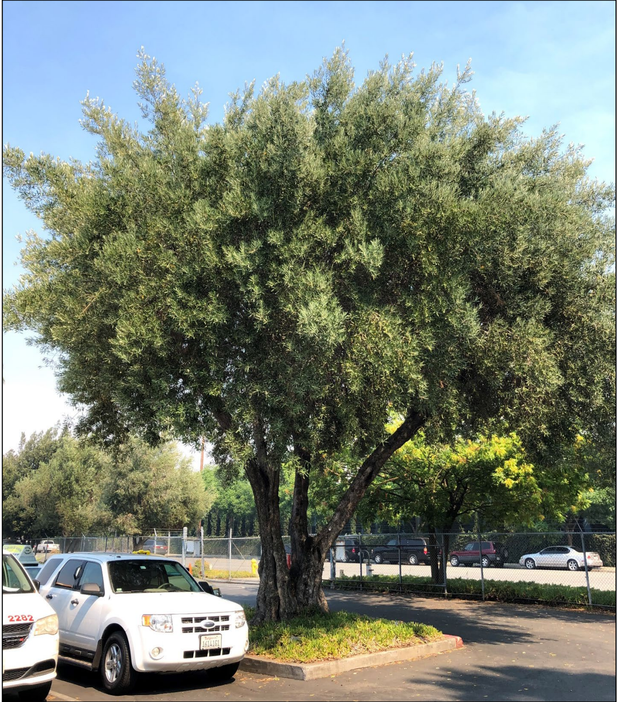
Photograph 7. Tree #255, a 172.1" circumference olive ( Olea europaea ) ordinance-size tree in the southern portion of the Project Area.