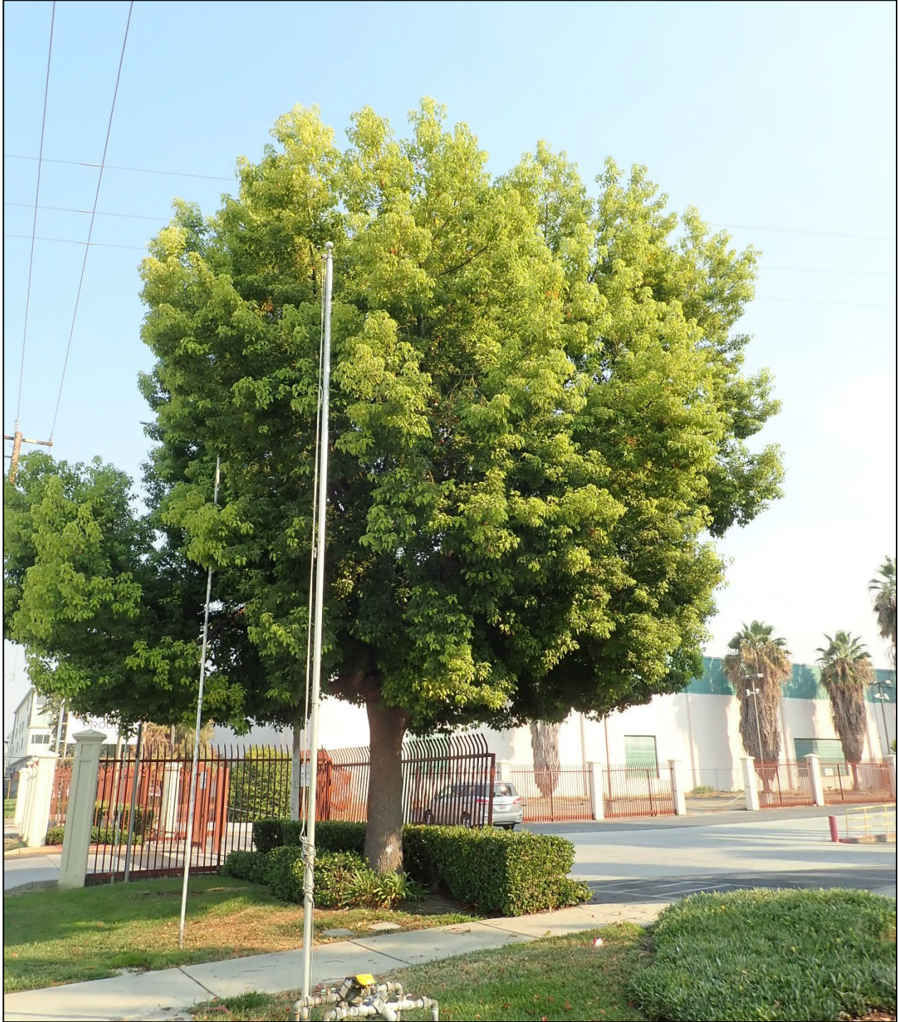
Photograph 1. Tree #110, a 57.8" circumference camphor ( Cinnamomum camphora ) ordinance-size tree in the northwest portion of the Project Area.