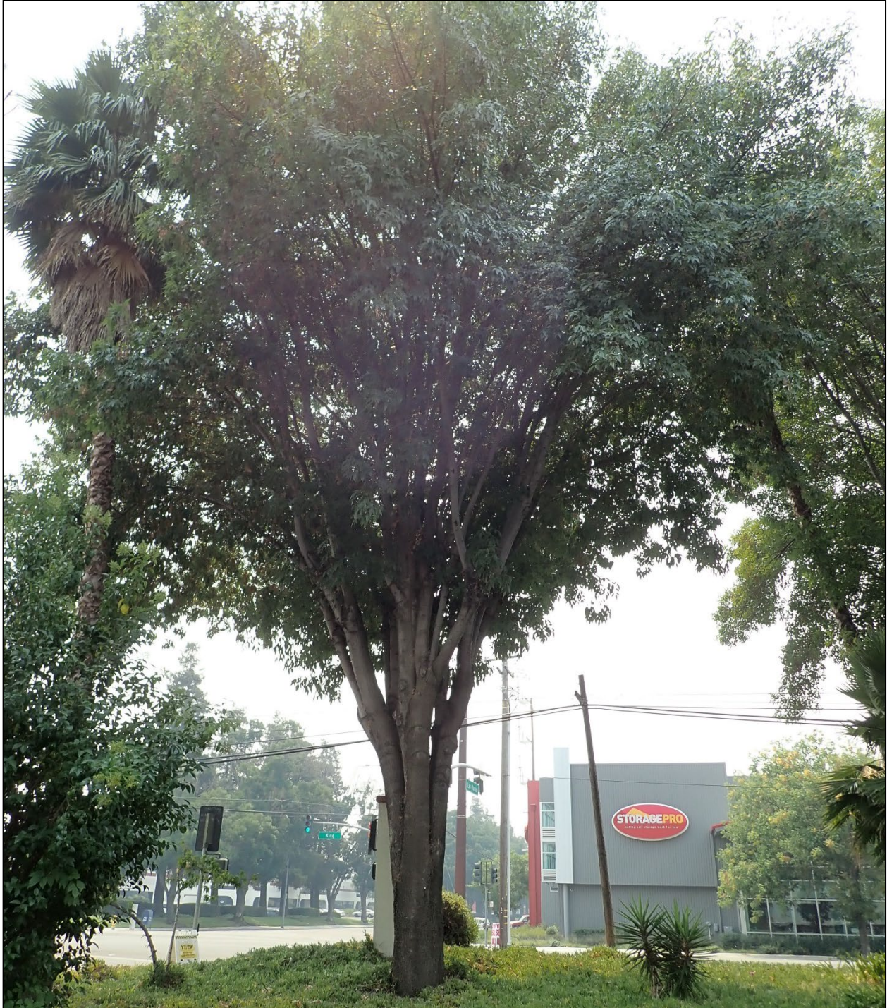
Photograph 6. Tree #205, a 111.8" circumference evergreen ash ( Fraxinus uhdei ) ordinance-size tree in the southern corner of the Project Area.