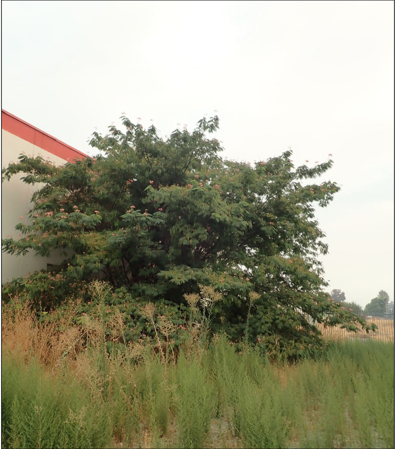
Photograph 4. Tree #145, a 110.5" circumference plume acacia ( Albizia lophantha ) ordinance-size tree in the northeast corner of the Project Area.