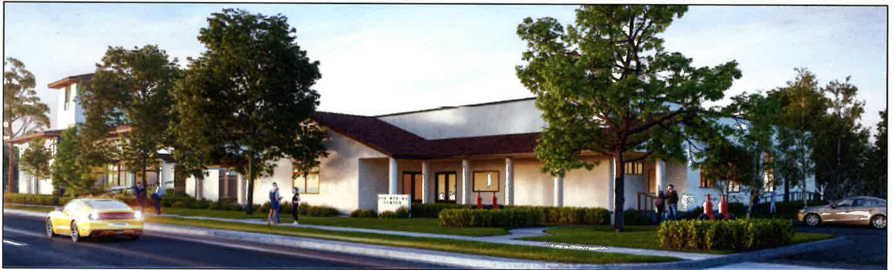
Exhibit 1 – Existing (Top) and Proposed (Bottom) View – Northwest Elevation San Marino Center Improvement Project