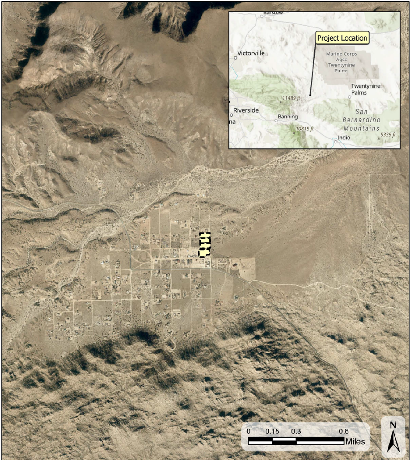
Figure 1 Regional Vicinity