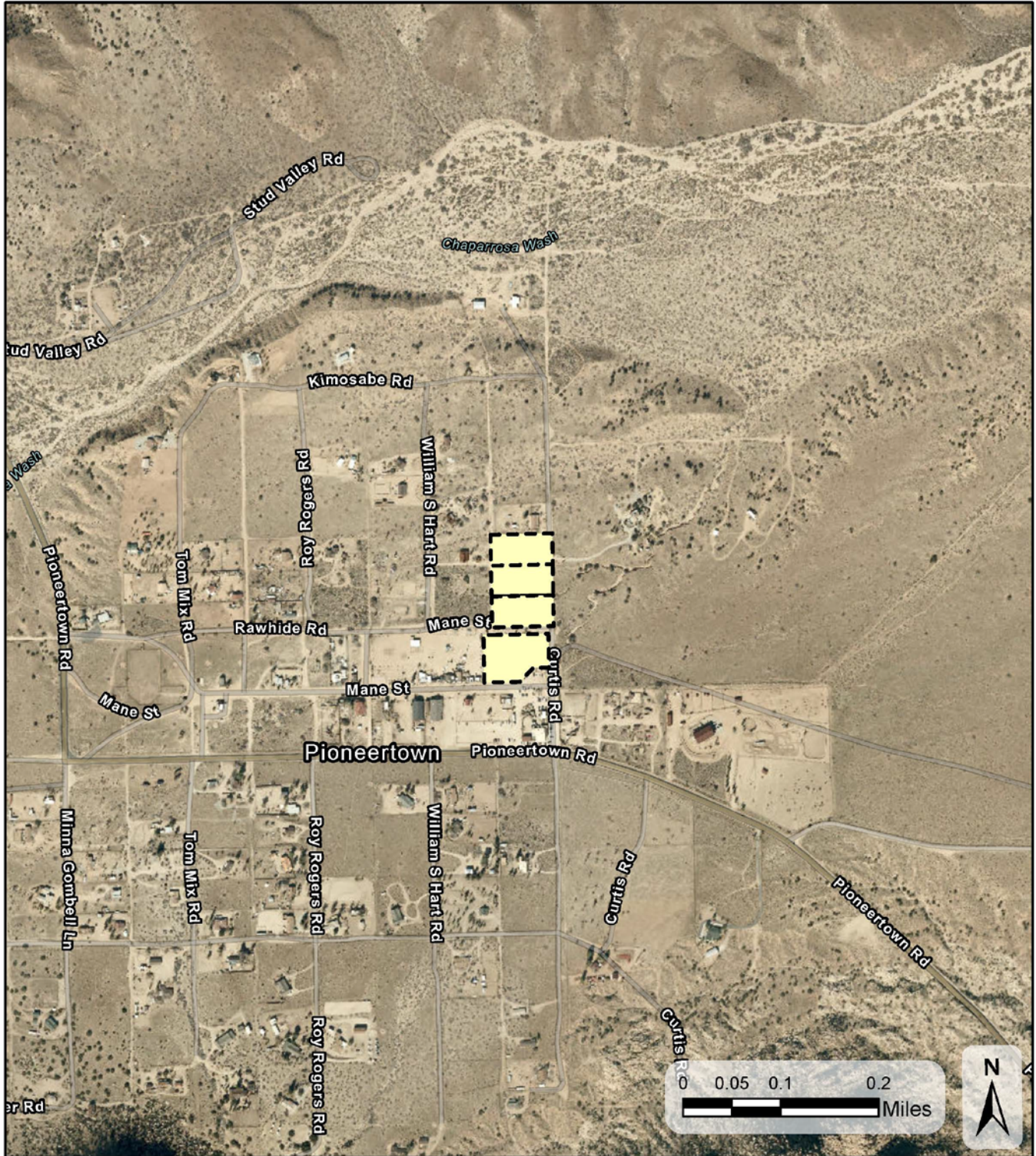
Figure 2 Aerial Imagery Map