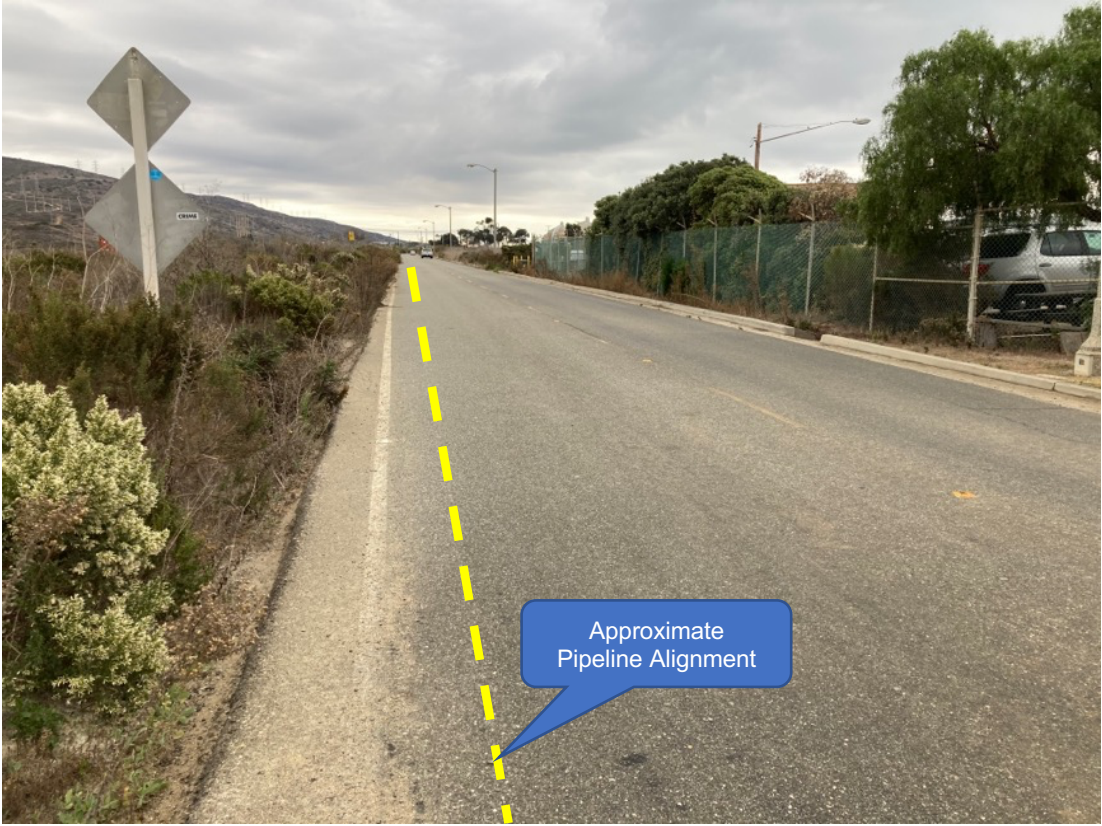
Figure 3. Photograph of proposed location of recirculating loop pipeline within Unnamed Loop Road.