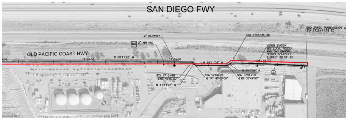
Figure 1. Proposed alignment of new 3-inch recirculating loop pipeline within the existing JRWSS 20-foot easement in Unnamed Loop Road and Old Pacific Highway.