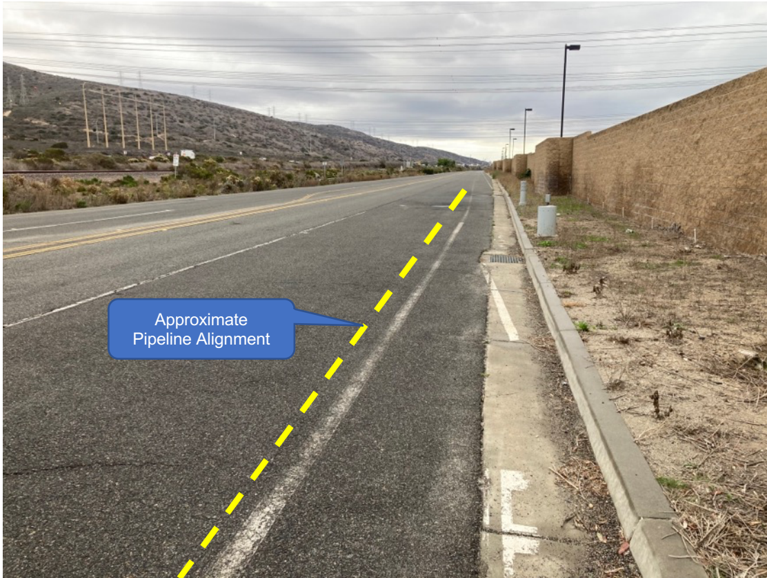
Figure 4. Photograph of proposed location of recirculating loop pipeline within Old Pacific Highway.