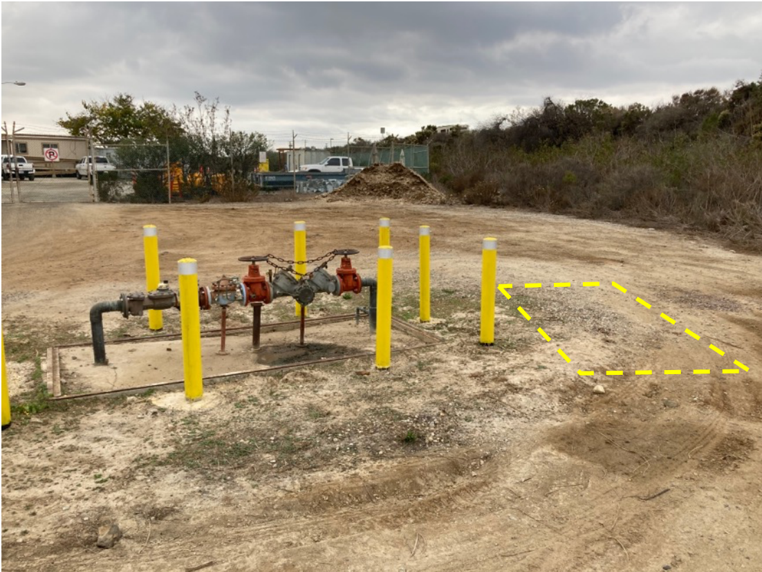
Figure 2. Photograph of proposed location of chlorine booster station and recirculating pump, adjacent to Unnamed Loop Road.