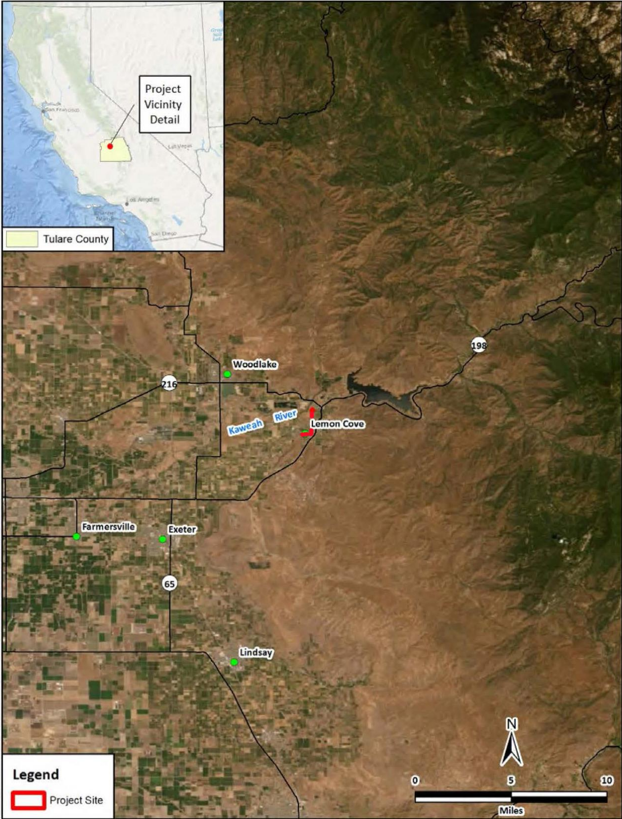
Figure 1 – Project Regional Map