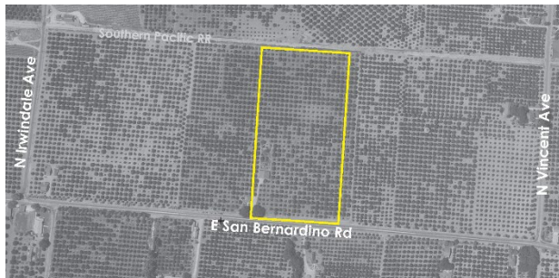
Figure 2: Historic aerial photograph showing project site outlined in yellow. 1934.

The Griswold School is closely surrounded by the city boundaries of West Covina to the south, Covina to the east, and Irwindale on the west (see Figure 1 ).