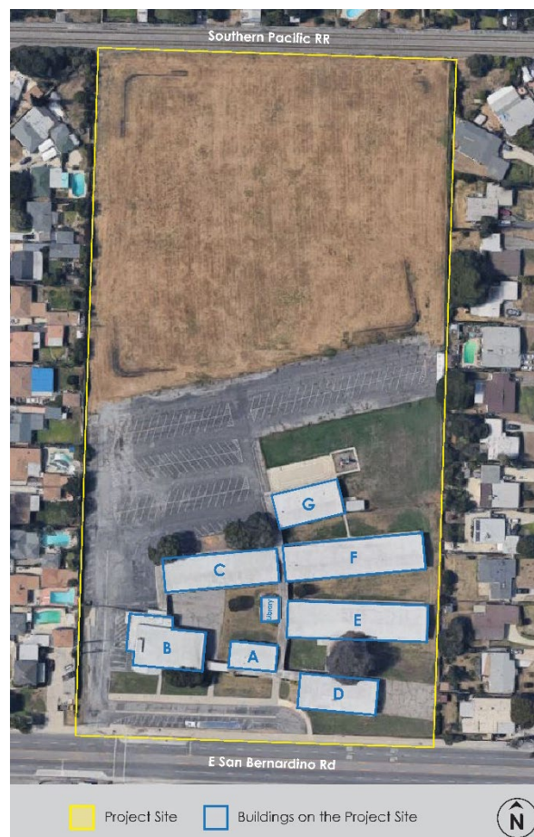
Figure 6: Base map courtesy of Google.

It should be noted that Buildings C through G are all classroom buildings and although they vary slightly in size and number of openings, they are generally the same in composition. Nonetheless, each building is described individually below.