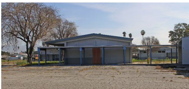
Figure 9: Building C. North elevation above and west elevation below. 2020.

Building C is a classroom building. It is the northeastern most building on the campus. It is one-story in height with a low pitch gabled roof with shallow boxed eaves on the south, east, and west elevations, and a wide, overhanging eave with fascia board on the north elevation. The roof appears to be clad in composition roofing and exterior walls are clad in stucco. Sheltered beneath the overhanging eave on the north elevation are classroom entrances. There are four partially glazed doors and two hollow-slab doors are incorporated within a window-wall consisting of metal, multi-light windows.