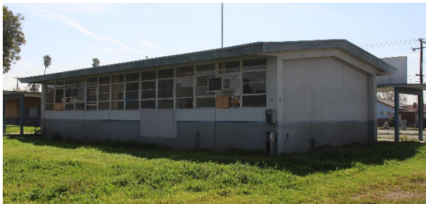
Figure 7: Building A. South elevation above and north and west elevation below. 2020.

Building A is the main office building. It is located near the center of the campus, oriented to the south, facing E. San Bernardino Road. The building is one-story in height, with a low pitch gabled roof with shallow, boxed eaves. The roof appears to be clad in composition roofing and exterior walls are clad in stucco.