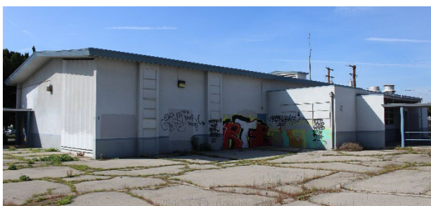
Figure 8: Building B. South and west elevation above and north and east elevation below. 2020.

Building B houses the “cafetorium,” which is presumably the cafeteria and auditorium space. The building is located on the southwest corner of the campus, overlooking the east driveway. The building is one-and-a-half-stories in height, with multiple, low-pitch gabled roofs with shallow, boxed eaves. A cupola with a louvered metal vent is located on the west end of the roof. The roof appears to be clad in composition roofing and exterior walls are clad in stucco.