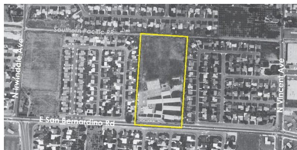
Figure 3: Historic aerial photograph showing project site outlined in yellow. 1960.

As depicted in historic aerials, the property and surrounding area were primarily cultivated with orchards in the 1920s and remained as such into the 1940s (see Figure 2 ). The adjacent cities began experiencing a housing boom in the late 1940s. Once residential development started, it boomed and quickly spread outside of established city boundaries. In the early 1950s, the hinterland was subdivided and developed with housing tracts (see Figure 3 ).