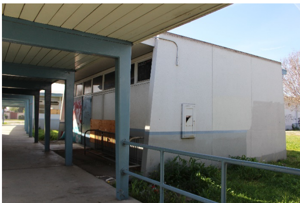
Figure 14: Library Building. East and north elevation. 2020.

The Library building at the center of the cluster of buildings on the campus is trapezoidal in massing. It is oriented toward the east. It has a flat roof with flush eaves on the north and south. Overhanging eaves shelter a row of clerestory windows on the east and west. There is a single entrance on the east elevation consisting of a hollow metal slab door beneath a row of metal, multi-light transom windows that extend the length of the elevation. There are no openings on the side elevations.