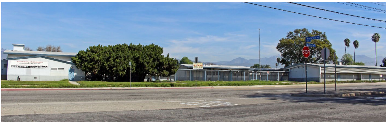
Figure 4: Griswold School campus, looking northeast from San Bernardino Road. March 2020.

The property is located on the north side of E. San Bernardino Road on a rectangular parcel bound by the Southern Pacific Railroad tracks on the north and tract housing development to the east and west. The buildings on the school campus are all on the southern portion of the parcel such that the campus fronts E. San Bernardino Road. The campus is setback from the four-lane thoroughfare by a narrow front lawn and driveway. The long, east-west driveway has an entrance curb cut near the center of the south property line and exit curb cut at the southwest corner of the property. The asphalt driveway extends north, about half-way along the west property line before turning about 45-degrees to the west, wrapping the rear of the school campus with surface