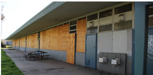
Figure 11: Building E. South and east elevation above and north elevation below. 2020.

Building E is a classroom building. It is located on the east side of the campus, between Building D (south) and Building F (north). The building is one-story in height with a low pitch gabled roof with shallow boxed eaves on the south, east, and west elevations, and a wide, overhanging eave with fascia board on the north elevation. The roof appears to be clad in composition roofing and exterior walls are clad in stucco. Sheltered beneath the overhanging eave on the north elevation are classroom entrances.