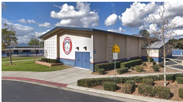
Figure 15: Barranca School. 2020.

Griswold designed approximately 25 projects for the Covina-Valley Unified School District, as well as many others including approximately 20 projects for the Compton Unified School District. While Gogerty is undoubtedly considered a master architect, the Griswold School campus is unlikely to be considered an important representation of his extensive portfolio of work. Within the Covina-Valley Union School District alone, it is one of many similar campus designs Gogerty completed. 27 The cafeteria building at the Barranca School (727 S Barranca Avenue, 1948-1953), for example, is nearly identical to that of the Griswold School (see Figure 15 ). Therefore, the Griswold School campus does not appear to be significant under Criterion C as representative of the notable work of a builder, designer or architect.