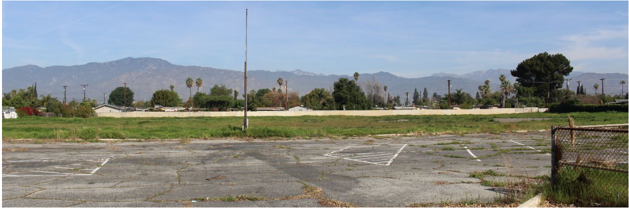
Figure 5: Griswold School campus, looking northeast from San Bernardino Road. March 2020.

parking. The northern half of the parcel is open field with chain-link fence batting cages at each corner the only remnants of baseball fields now overgrown. The parcel is partially enclosed on the east and west property lines by chain-link fence. A concrete wall is along the north property line.