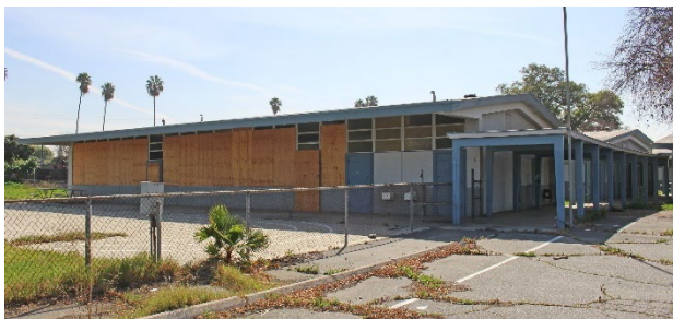
Figure 13: Building G. South elevation above and north and west elevation below. 2020.

Building G is a classroom building. It is located north of the other buildings, overlooking a concrete slab with painted track adjacent to a playset. The building is one-story in height with a low pitch gabled roof with shallow boxed eaves on the gable ends and wide, overhanging eaves with fascia board on the gable sides. The roof appears to be clad in composition roofing and exterior walls are clad in stucco. Sheltered beneath the eaves on the north and south elevation are classroom entrances. There are four slab doors on the north elevation incorporated within a window-wall consisting of metal, multi-light windows.