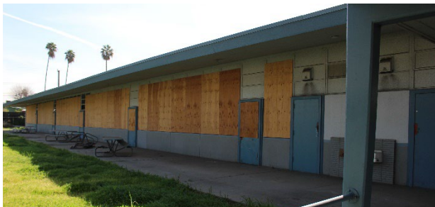
Figure 12: Building F. South elevation above and north elevation below. 2020.

Building F is a classroom building. It is located on the east side of the campus, between Building E (south) and building G (north). The building is one-story in height with a low pitch gabled roof with shallow boxed eaves on the south, east, and west elevations, and a wide, overhanging eave with fascia board on the north elevation. The roof appears to be clad in composition roofing and exterior walls are clad in stucco. Sheltered beneath the overhanging eave on the north elevation are classroom entrances.