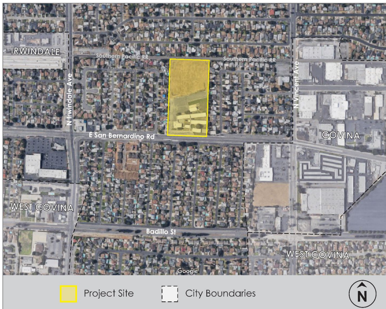
Figure 1: Project location.

The purpose of this report is to analyze whether or not a future redevelopment project would impact historical resources as defined by the California Environmental Quality Act (CEQA). The potential project site consists of one property located at 16209 E. San Bernardino Road in Vincent, CA, a census-designated place in unincorporated Los Angeles County. The property is associated with Assessor Parcel No. 8435-006-900 and is comprised of a decommissioned public school, the Griswold School, in the Covina-Valley Unified School District ( Figure 1 ).