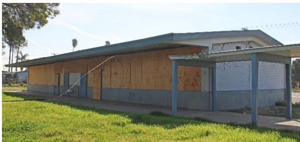
Figure 10: Building D. South and east elevation above and north and west elevation below. 2020.

Building D is a classroom building. It is located at the southeast corner of the campus. The building is one-story in height with a low pitch gabled roof with shallow boxed eaves on the south, east, and west elevations, and a wide, overhanging eave with fascia board on the north elevation. The roof appears to be clad in composition roofing and exterior walls are clad in stucco. Sheltered beneath the overhanging eave on the north elevation are classroom entrances.