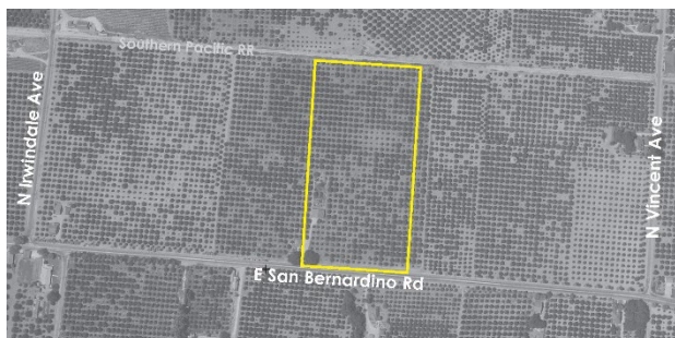
Figure 2: Historic aerial photograph showing project site outlined in yellow. 1934.

The Griswold School is closely surrounded by the city boundaries of West Covina to the south, Covina to the east, and Irwindale on the west (see Figure 1 ).