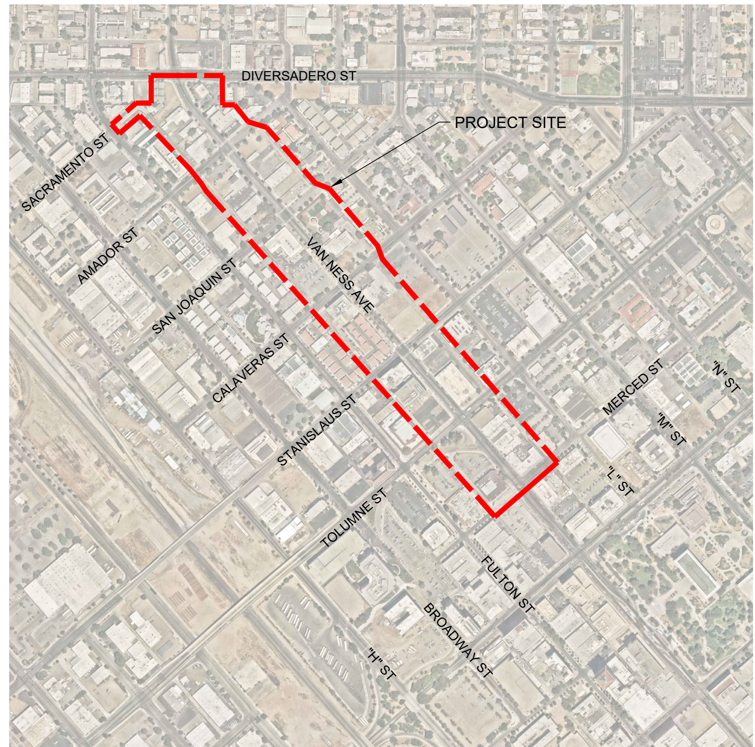
PROJECT SITE SCALE: 1"=500'