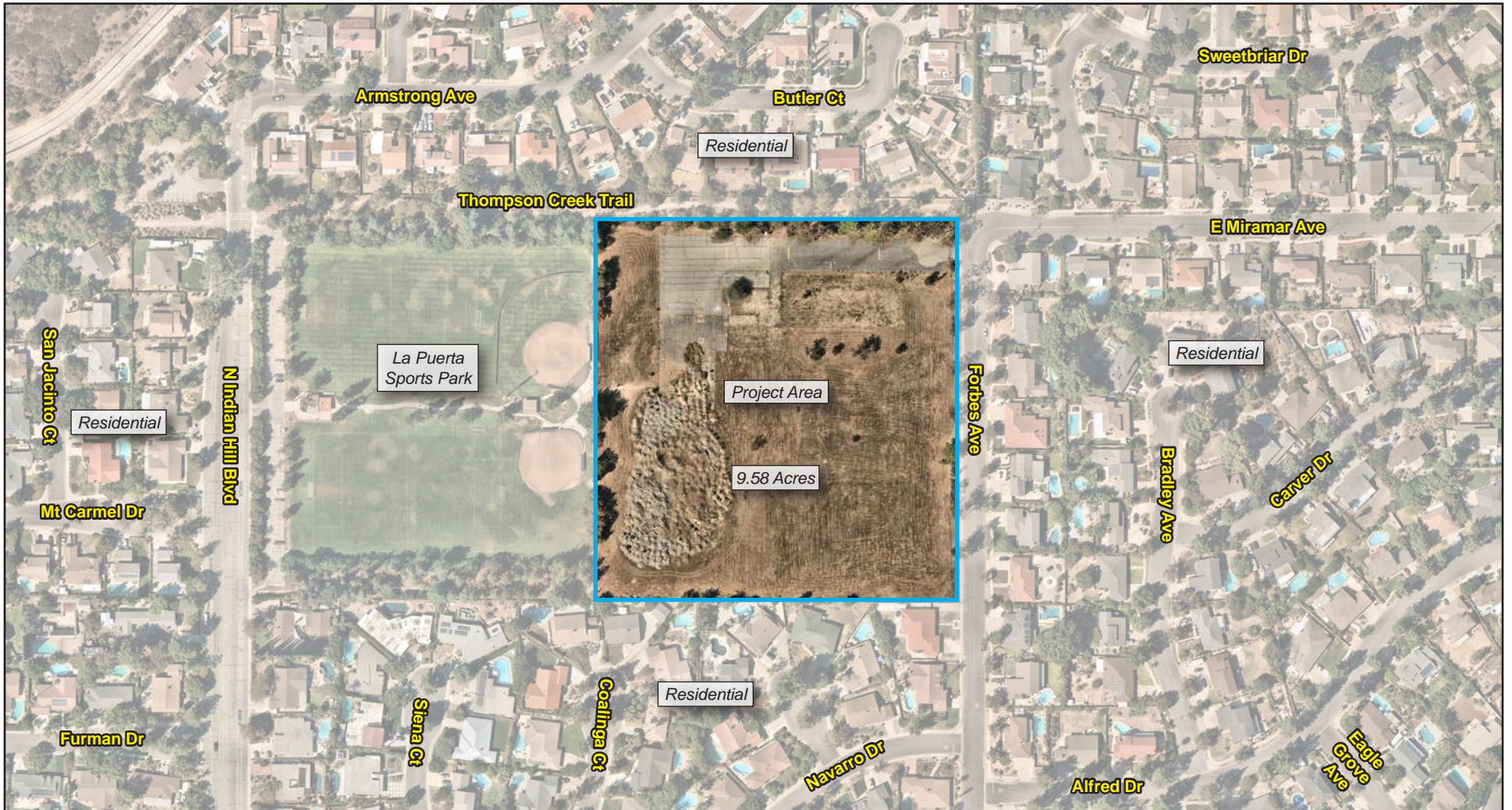
Figure 2 - Aerial Photograph of Project Area