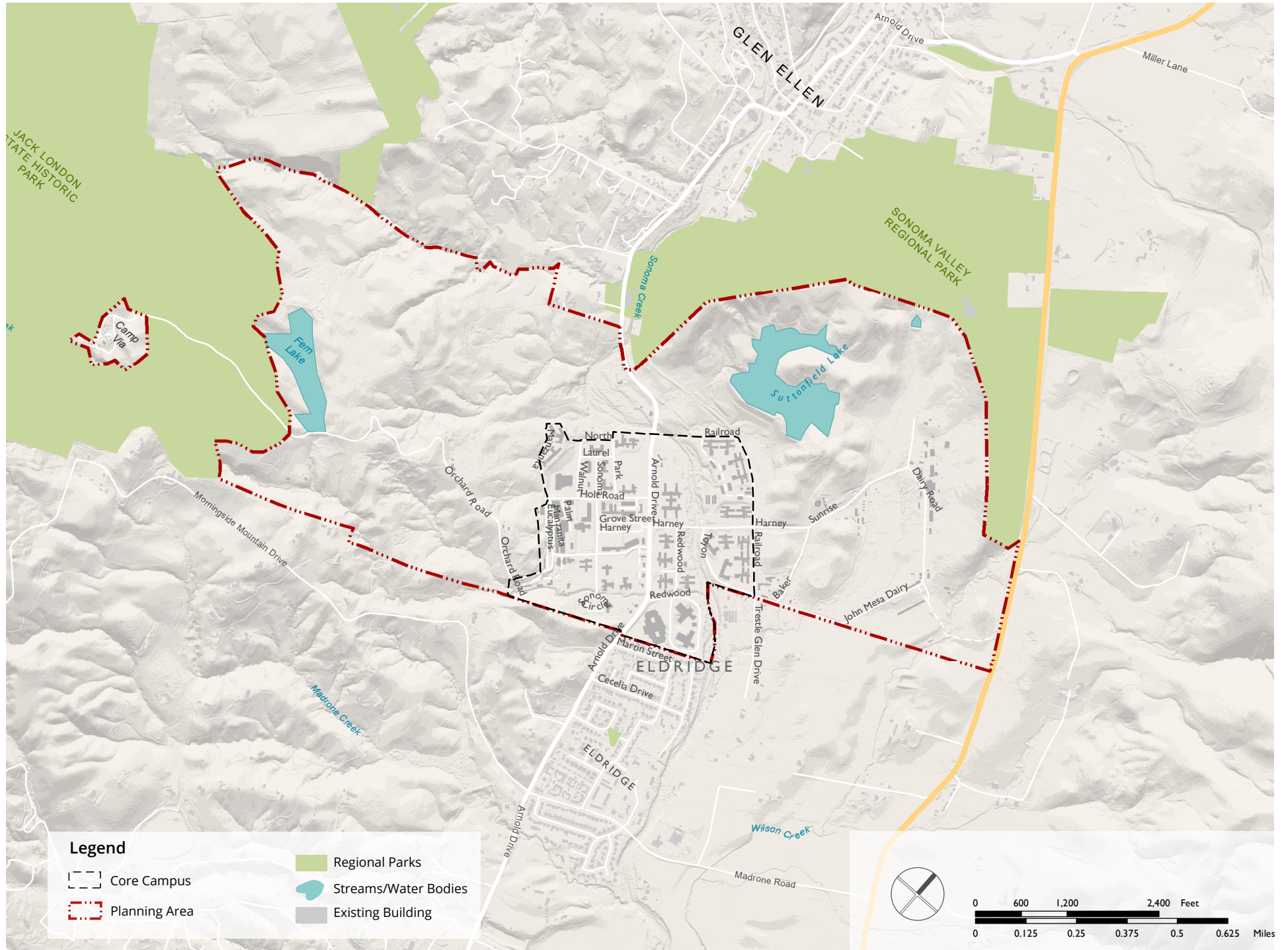
FIGURE 2: PLANNING AREA