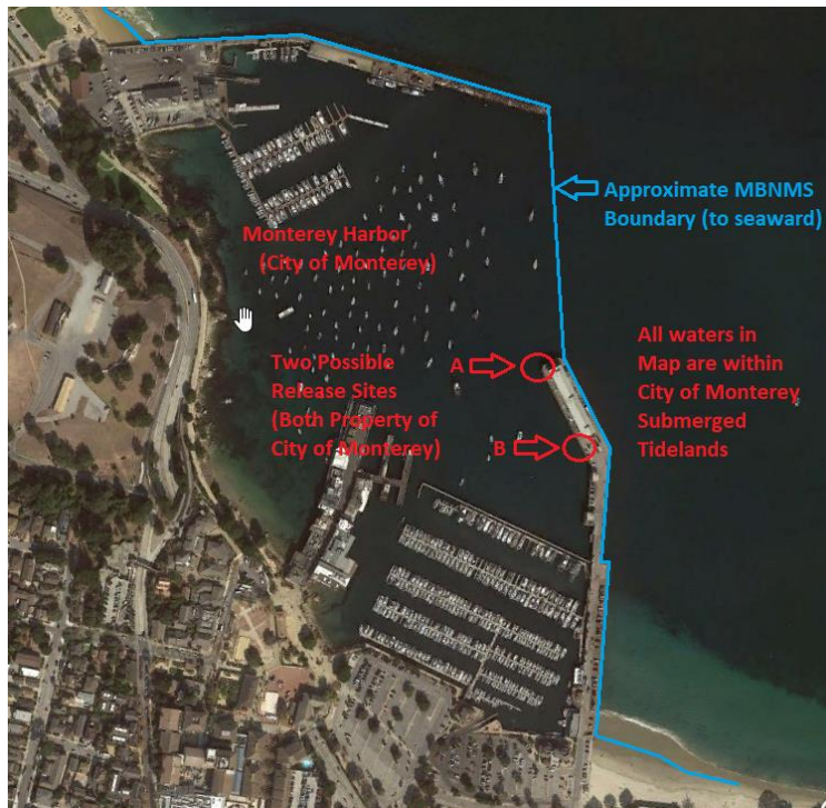
Attachment 1: Monterey Harbor release locations. Red circles indicate approximate potential release sites. All releases will be interior to Municipal Wharf #2.