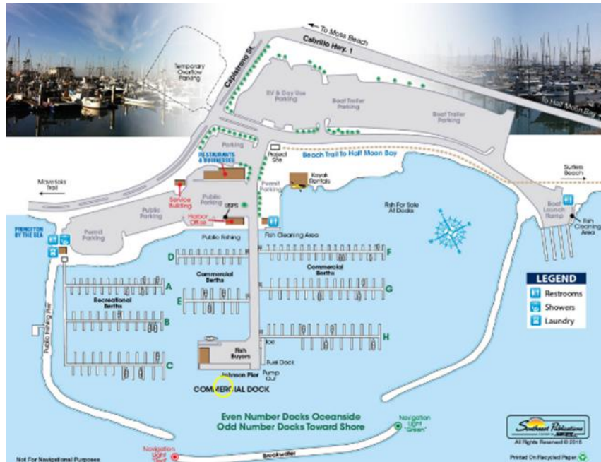
Attachment 1: Pillar Point Harbor net pen location. Yellow circle indicates approximate net pen site. Release after acclimation will be in outer harbor.