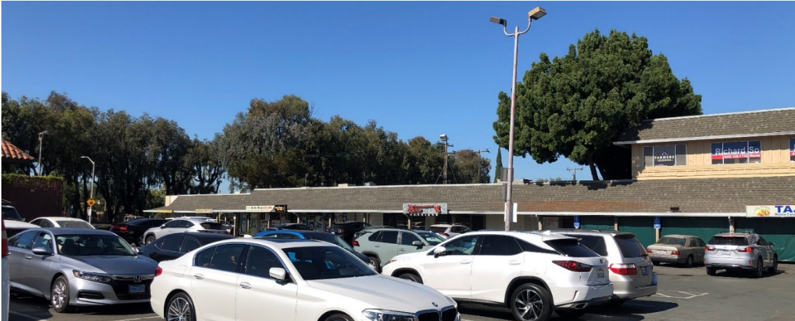
Figure 7. Looking northwest at the commercial complex on parcel 220-32-057.