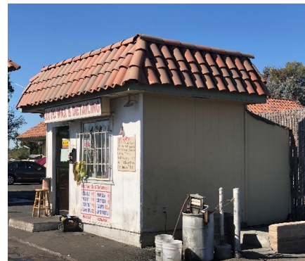
The canopy and the kiosk on parcel 220-32-058.