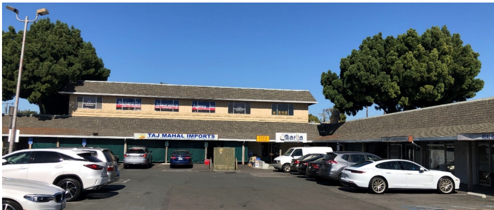
Looking north at the two-story portion of the commercial complex.