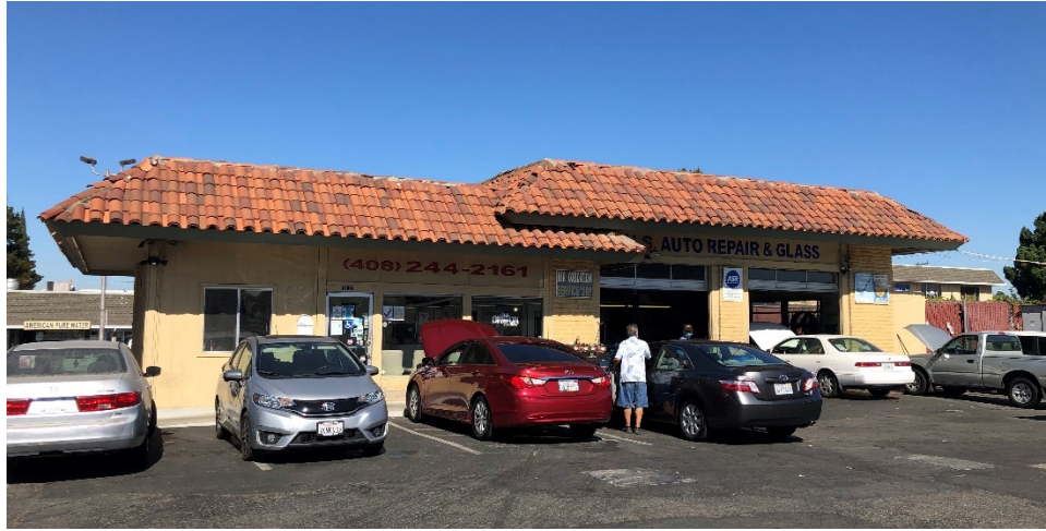
Figure 11. The front façade of the service building on parcel 220-32-058.