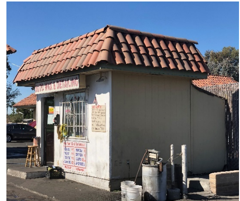
Figures 12 and 13. The canopy and the kiosk on parcel 220-32-058.