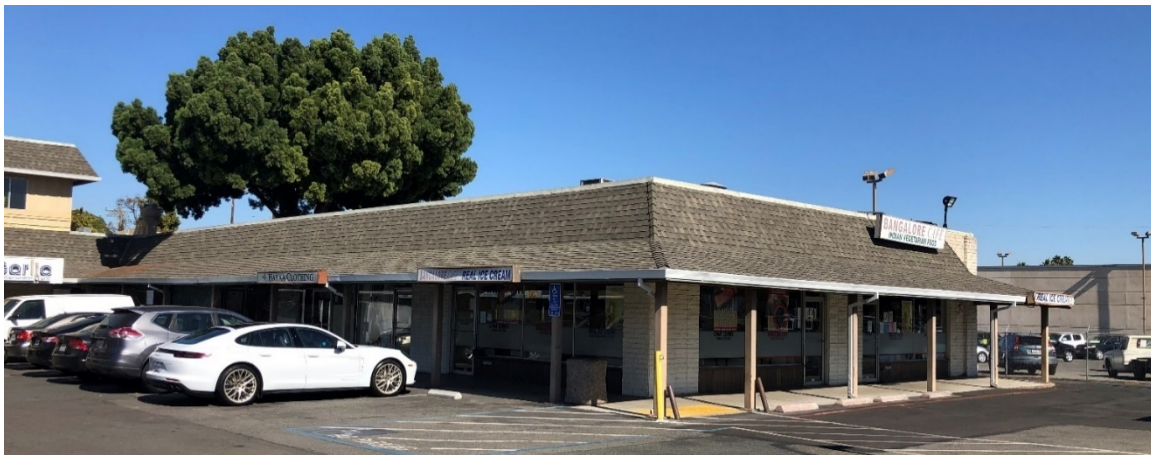
Figure 5. Looking northeast at the commercial building on parcel 220-32-057.

A freestanding sign with a tile-clad gable roof identifies the plaza as “Bowers Plaza.” Two square posts support the roof which shelters a bell. Many of the businesses in the plaza are identified on the illuminated sign. The signage appears to have been modified over the years as businesses changed within the plaza.