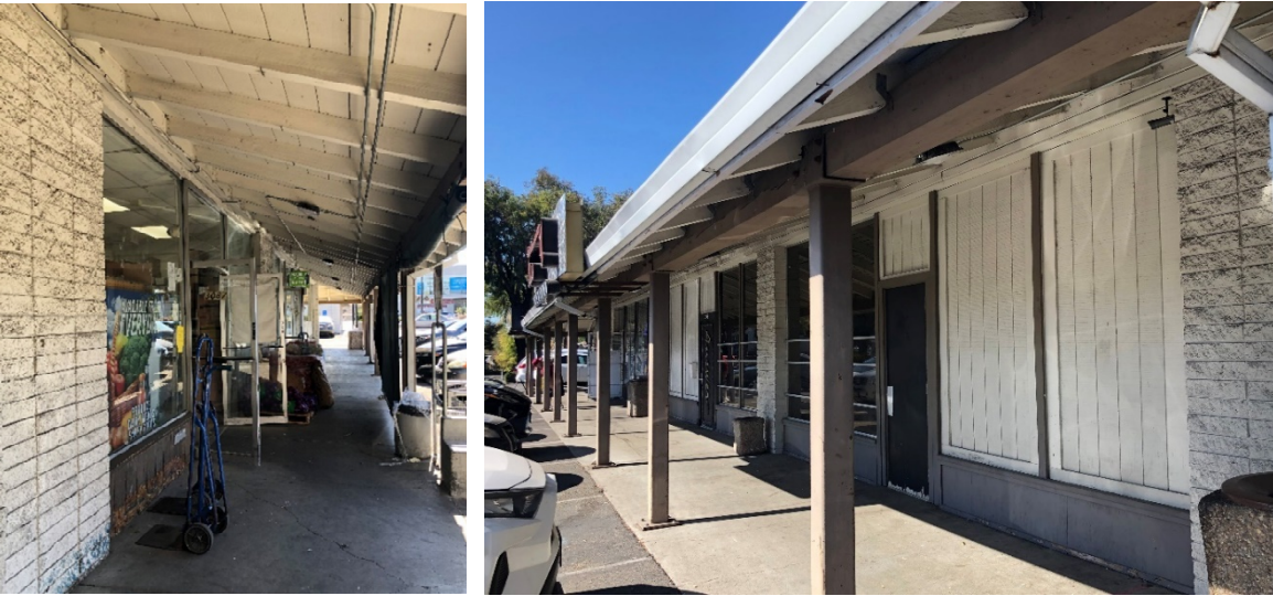
Figures 8 and 9. The sheltered walkways along the storefronts.