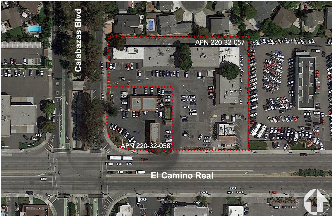
Figure 1. The subject parcels at the intersection of El Camino Real and Calabazas Boulevard, outlined in red.

The project site is located north of El Camino Real and east of Calabazas Boulevard in Santa Clara. The site occupies the northeast corner of this prominent intersection. El Camino Real (State Route 82) is one of the main arterial east/west roads that run through the city connecting San Jose to Sunnyvale. The site features multiple structures: a single-story restaurant and three one- to two-story commercial structures arranged in an L-shaped complex, associated with 3141 El Camino Real (APN 220-32-057), and a single-story commercial building, a canopy structure and a single-story auto repair building all associated with 3155 El Camino Real (APN 220-32-058). The large L-shaped complex houses numerous commercial units from restaurants to offices. Paved parking separates all the structures from one another. A tall free-standing sign indicates the name of the shopping plaza – Bowers Plaza – and features a clay tile gable top, a mission bell, as well as other signage for businesses on the site. Near the intersection, a pole features signage for the auto businesses. To the east of the project site is an auto dealership. Other auto related businesses are located across El Camino Real to the south and Calabazas Boulevard to the west. A residential neighborhood stands to the north of the project site.