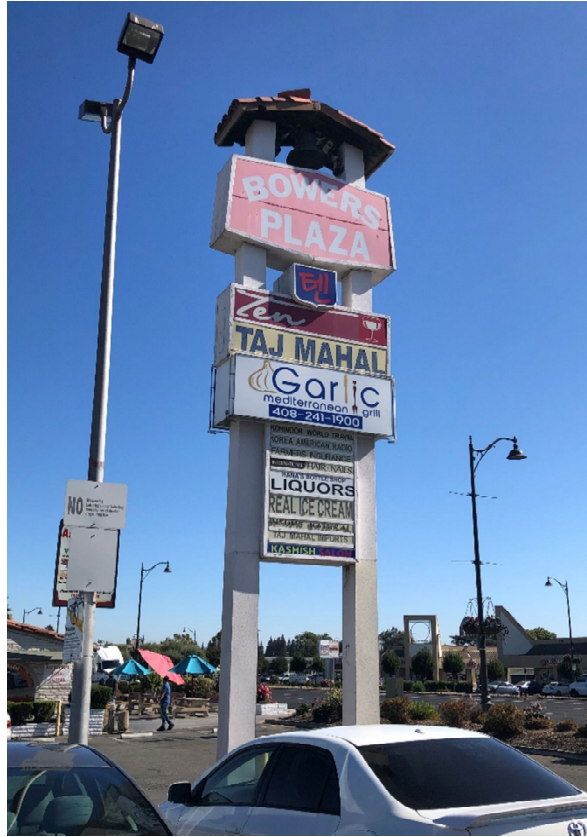
Figure 10. The freestanding sign along El Camino Real.