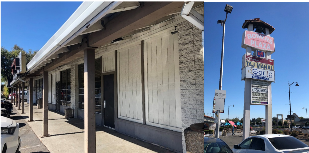
The sheltered walkways along the storefronts (right), and the freestanding sign along El Camino Real (left).