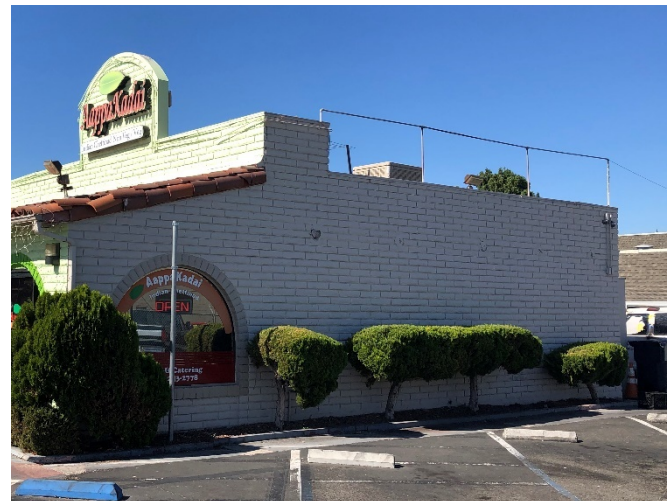
Figures 3 and 4. The north and south façades of the restaurant building on parcel 220-32-057.