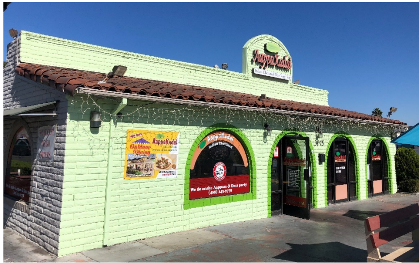
Figure 2. The front façade of the restaurant building on parcel 220-32-057.

which span to the ground and serve as doors, while the other is a fixed window. These openings are offset to the east side of the structure. The east façade features a single arched window, while the west façade has three. At the west side of the north façade there is an arched window similar to the others found around the building. All window and door openings have aluminum assemblies, except for two flush doors on the north side. A small canopy on the north side of the building protects several doors. A small canvas canopy adorns the west side of the building and shelters the three arched windows. A seating area runs the length of the building on the El Camino Real side of the structure. Planters are present on the east, south and west sides of the building and contain modest shrubs and bushes. A large post mounted sign, west of the structure, displays information about the restaurant on site. Today the building houses a restaurant serving Indian cuisine.