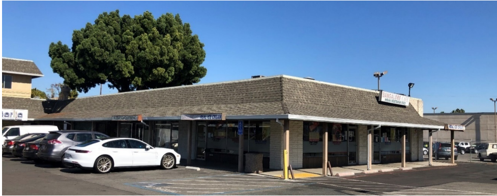
Looking northeast at the commercial building.