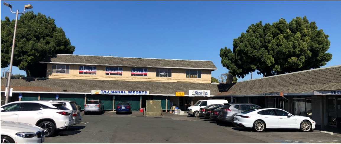
Figure 6. Looking north at the two-story portion of the commercial complex on parcel 220-32-057.