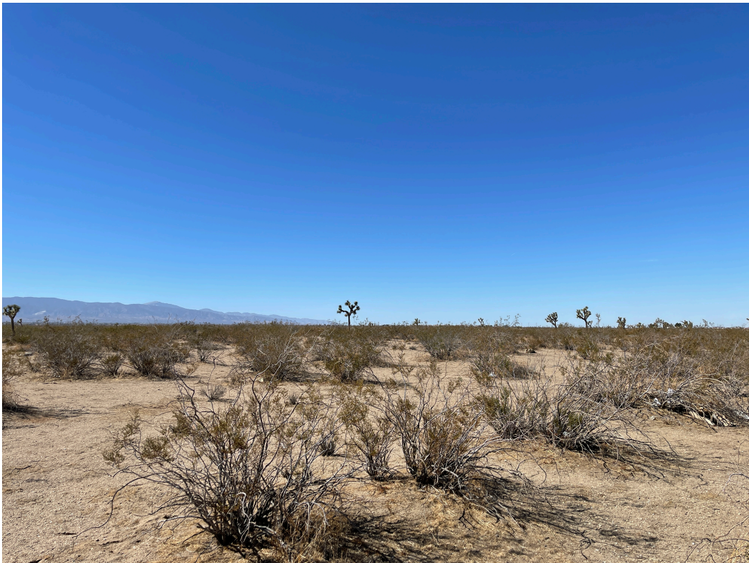
CENTER OF SITE LOOKING WEST