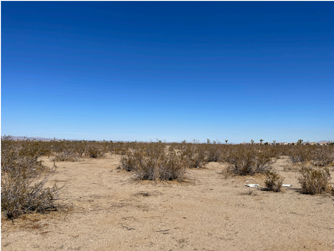
CENTER OF SITE LOOKING NORTH