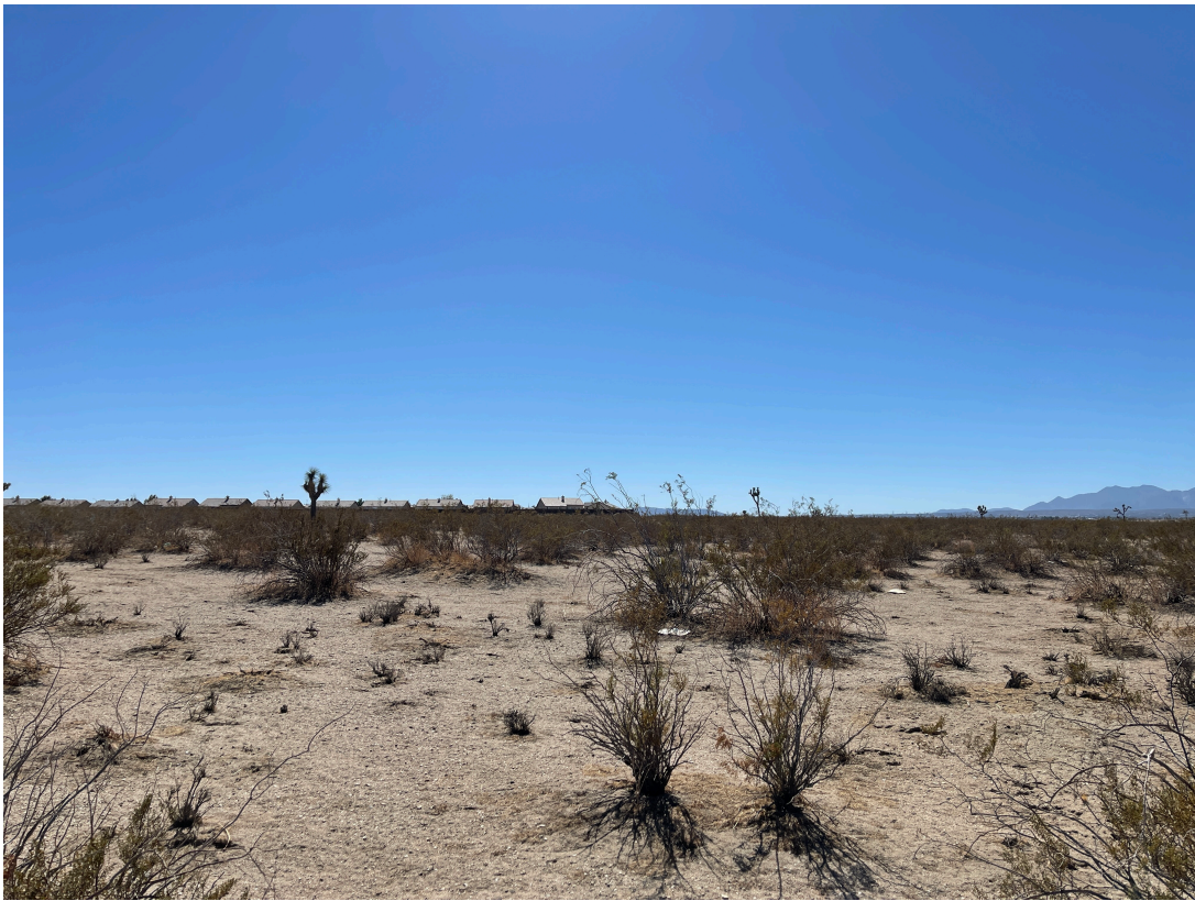
CENTER OF SITE LOOKING SOUTH