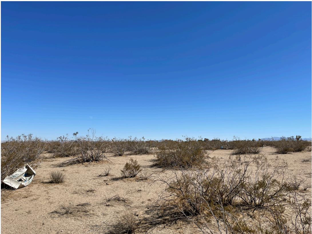
CENTER OF SITE LOOKING EAST