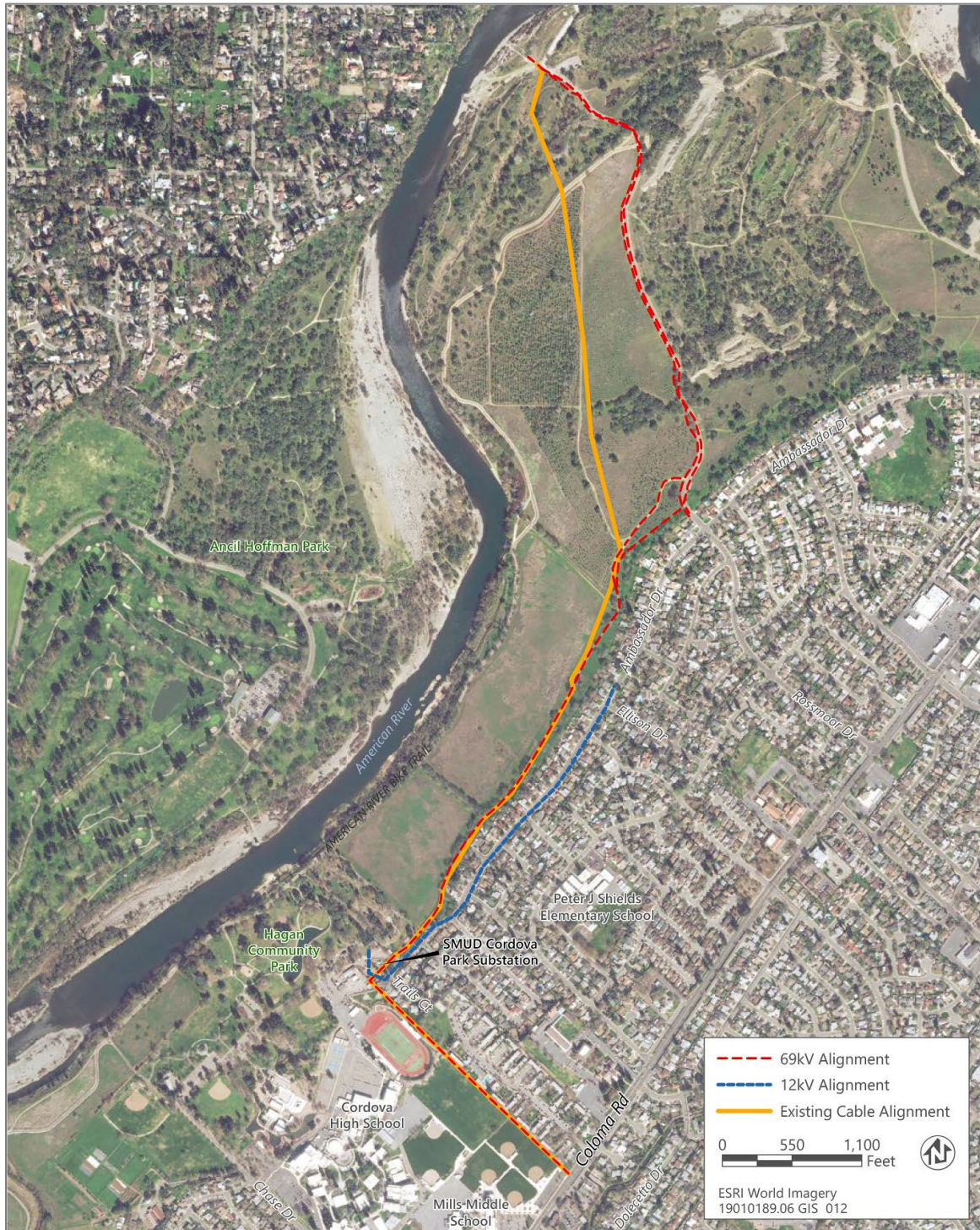
Figure 2. Project alignments