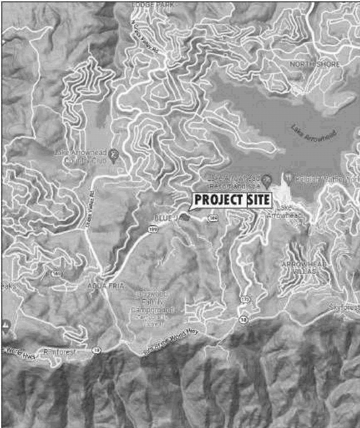
Figure 1 Regional Map