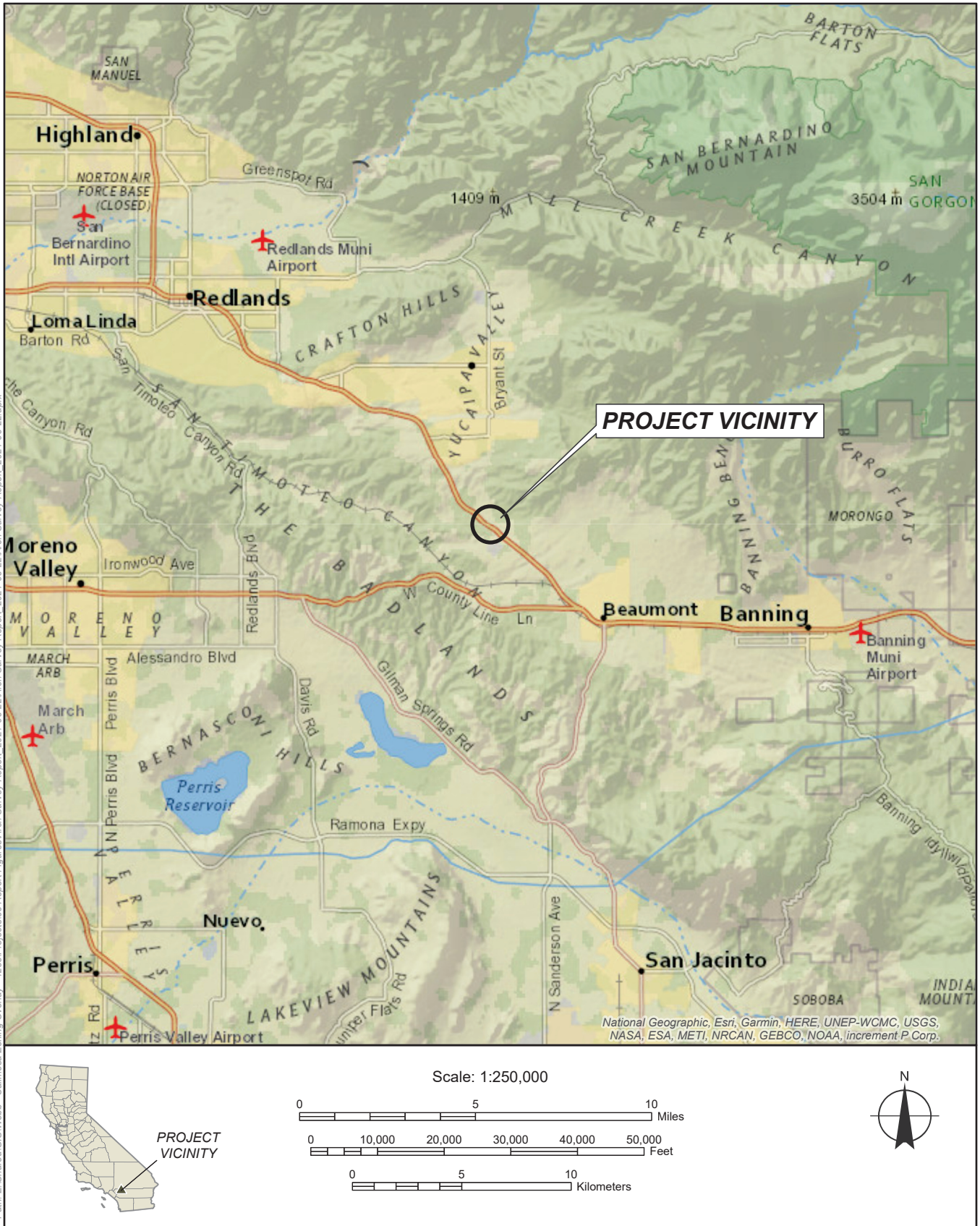
Figure 1 Project vicinity.