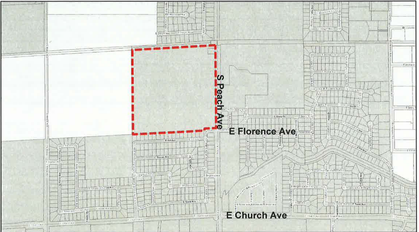
Exhibit A – Vicinity Map