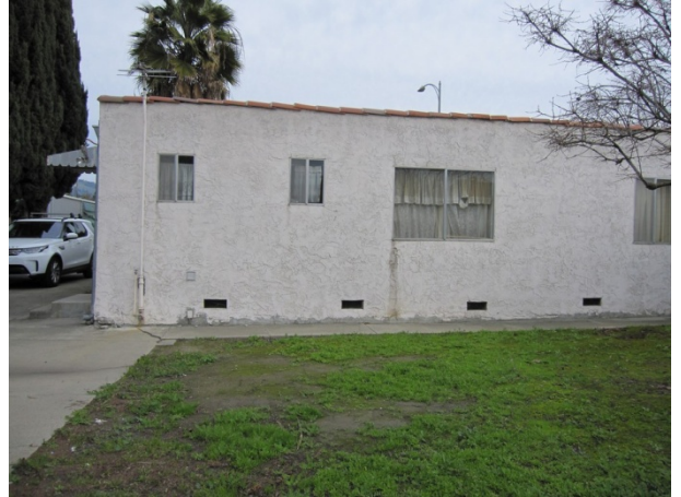
Photograph 2. View of the on-Site residence looking east.