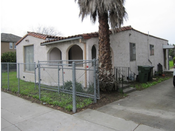
Photograph 1. View of the on-Site residence looking southwest.