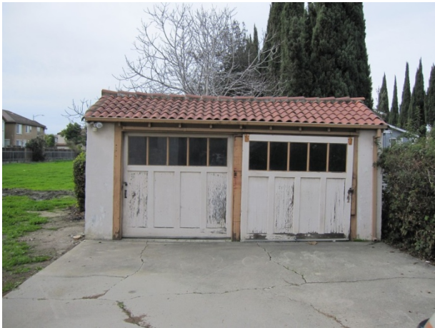
Photograph 3. View of the detached garage looking west.