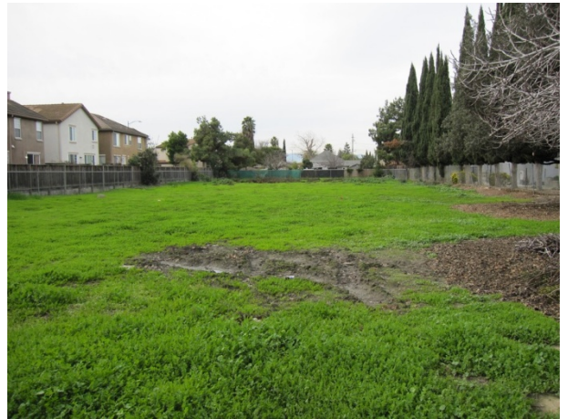
Photograph 4. View the western, undeveloped portion of the Site, looking west.