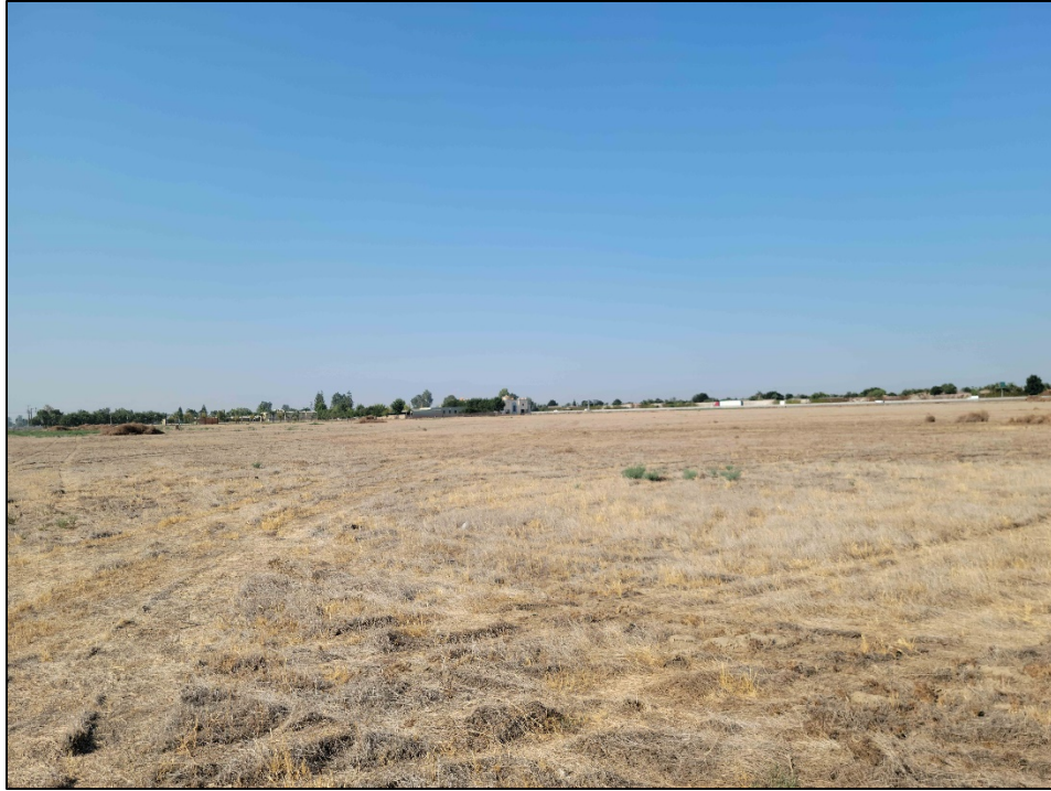
Figure 2. Overview of proposed The Crossings Project study area, looking southwest.