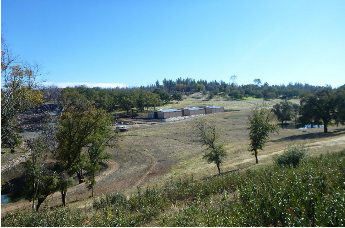
Figure 5: View of cultivation premises on APN 16-027-044 looking north