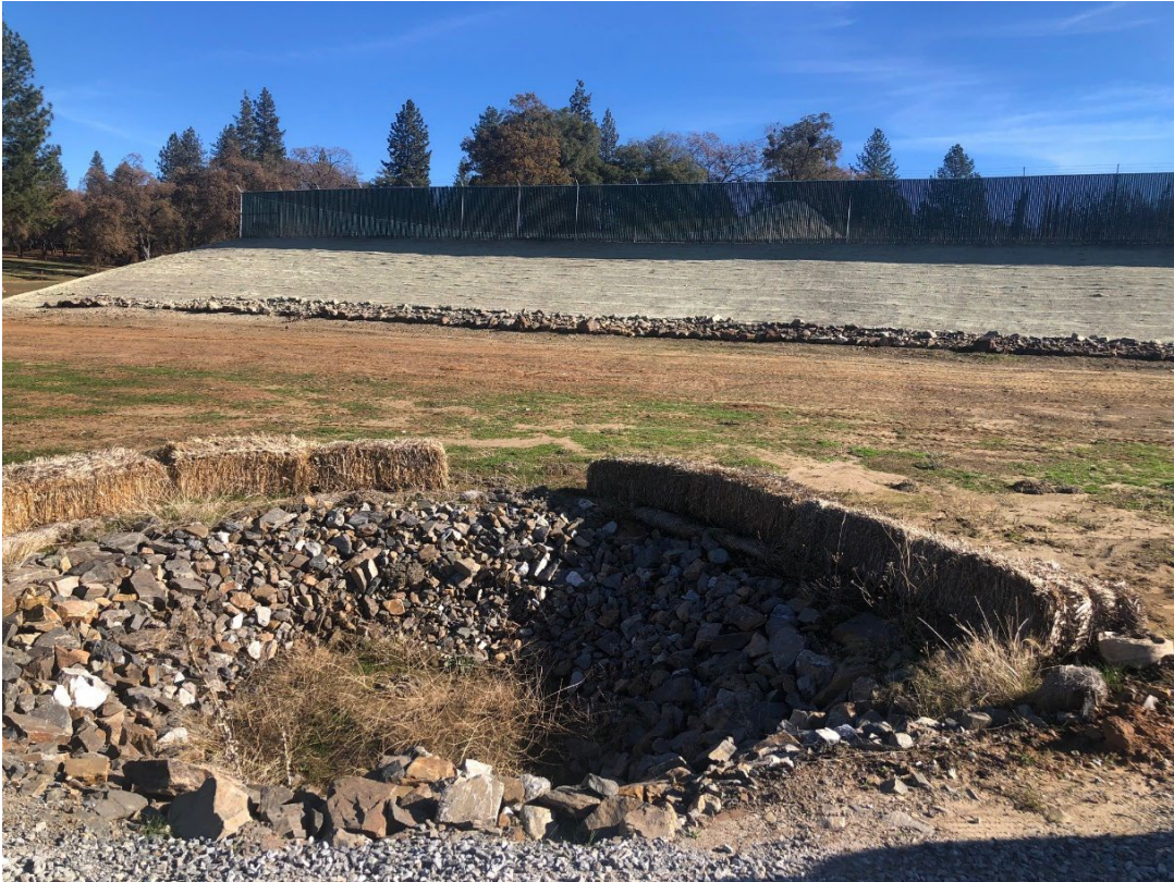
Figure 7: View of stream channel and seasonal pond in the southern portion of 16-027-045 (from Strange Aquatic Resources 2021 Biological Site Assessment)