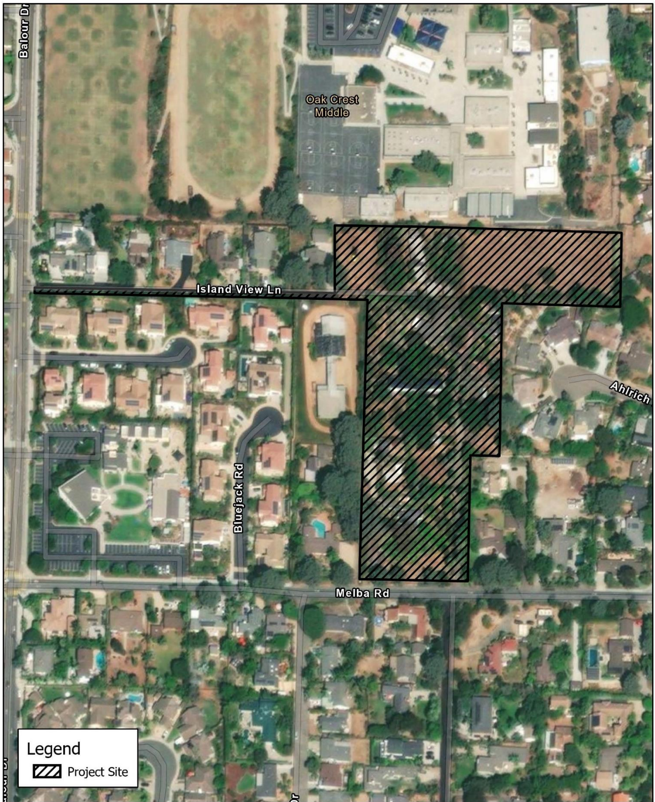
Project Location Torrey Crest Residential Subdivision Figure 1