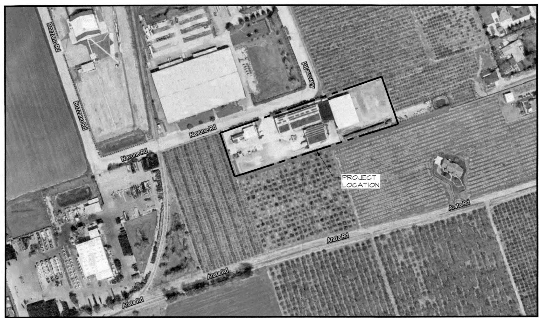
1 VICINTY MAP SCALE: NTS