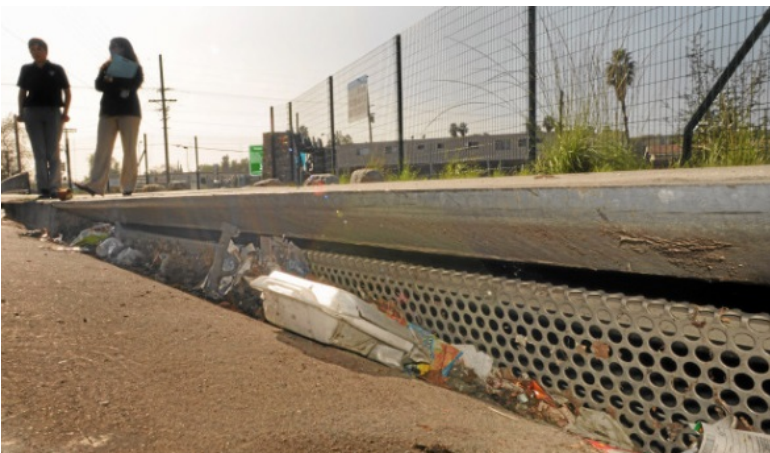
Example automatic retractable screens. To be installed Countywide in strategic locations.