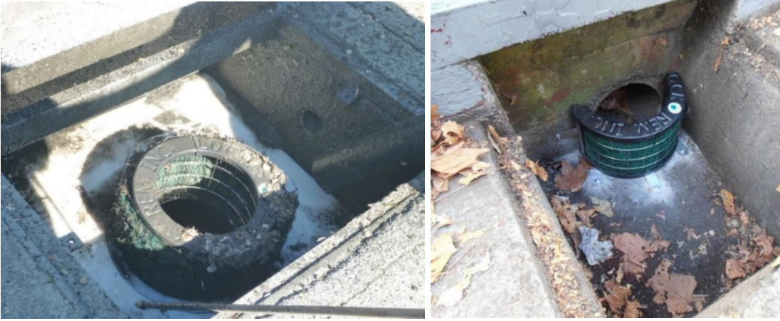
Example baskets (top hats and crescent types). Approximately 98 baskets to be removed in Bay Point, El Sobrante, and Pacheco areas.