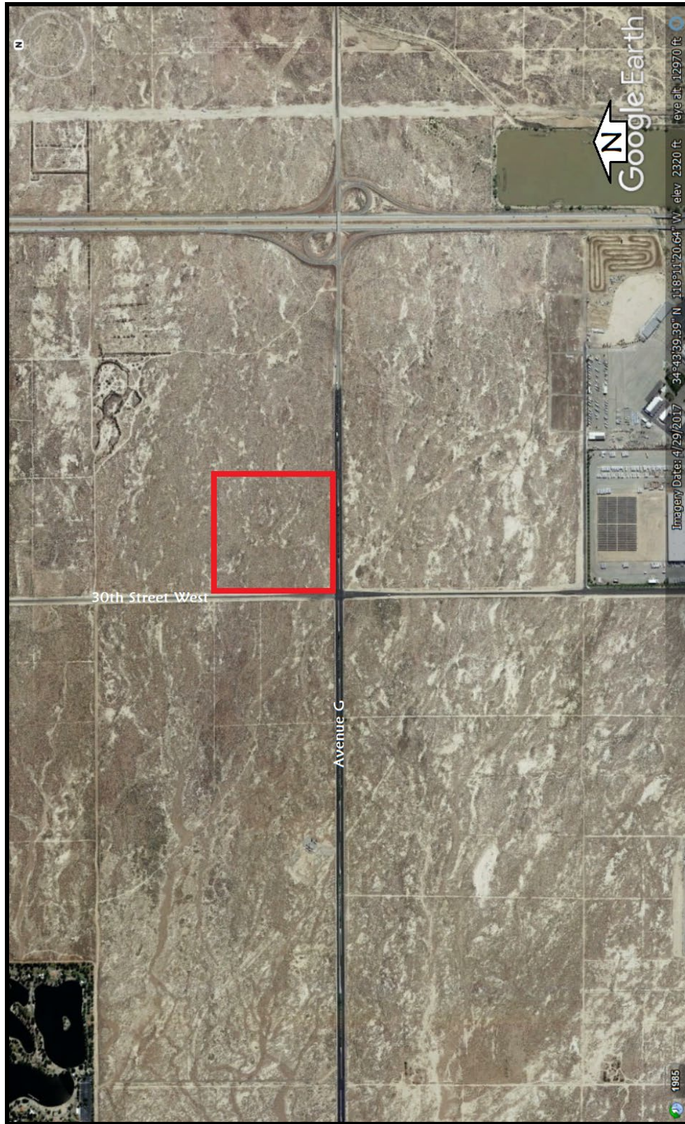
Figure 3. Approximate location of study area showing surrounding land use as depicted on excerpt from Google Earth Aerial Photography, April 2017.