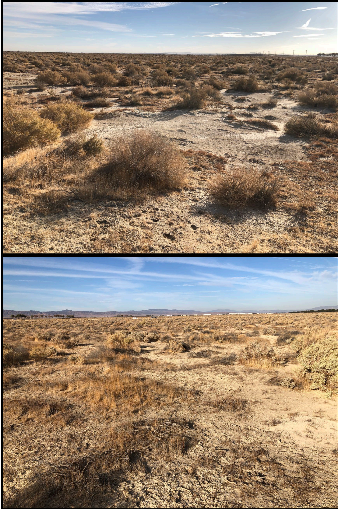
Figure 4. Representative photographs depicting general site characteristics.