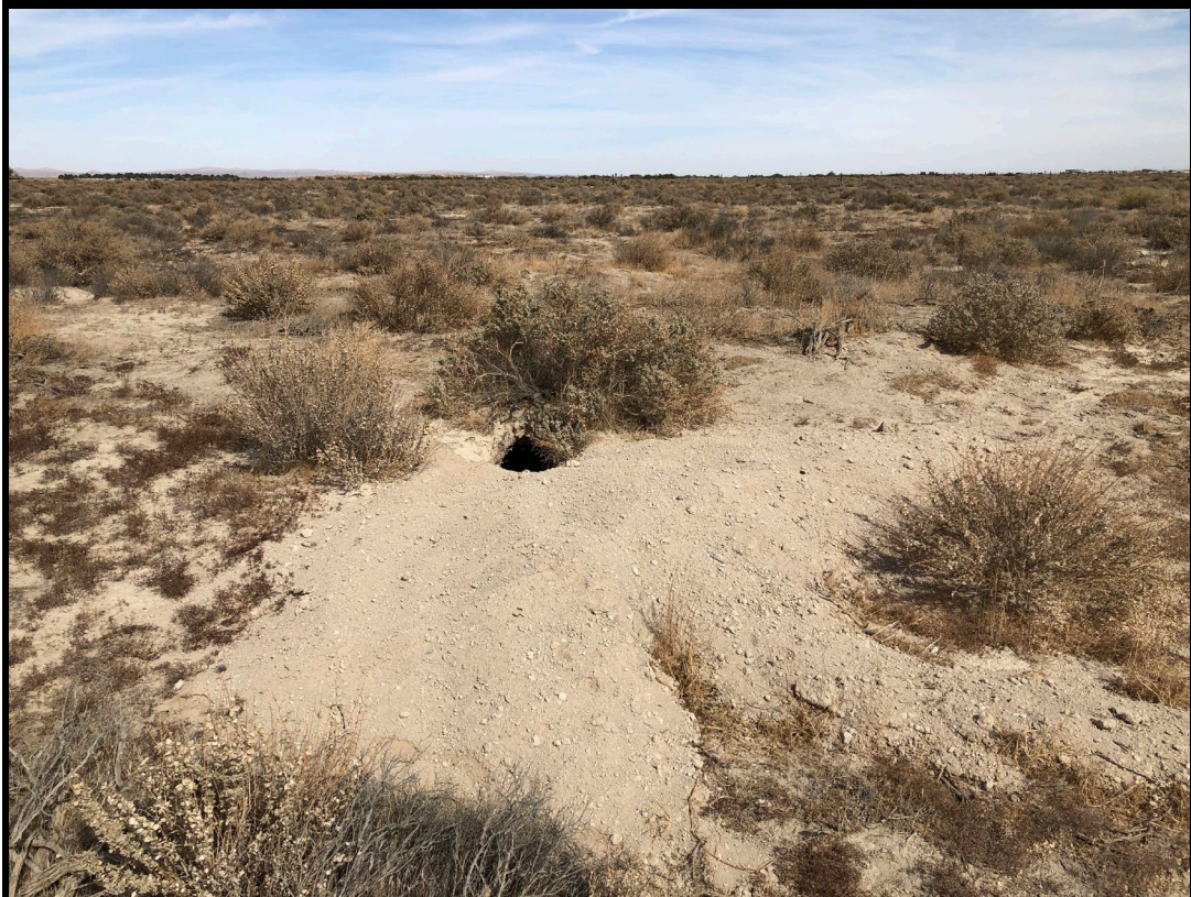
Figure 5. Top is a representative photograph depicting general site characteristics. Bottom photograph is the occupied burrowing owl cover site.