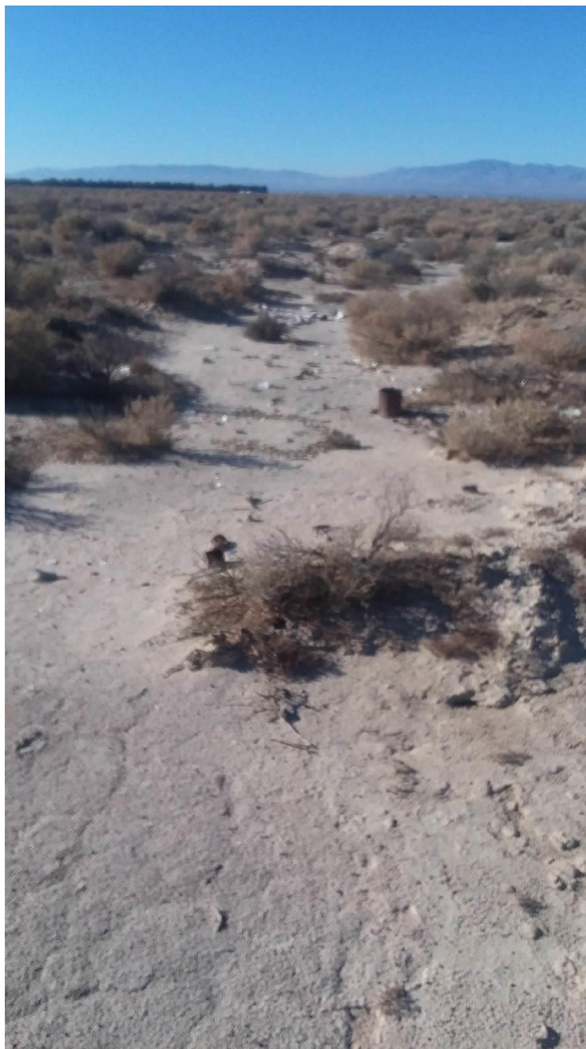
Figure 8 Site D&D-3, View to the North