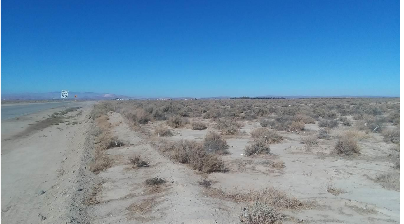
Figure 2 Project Area, View to the North