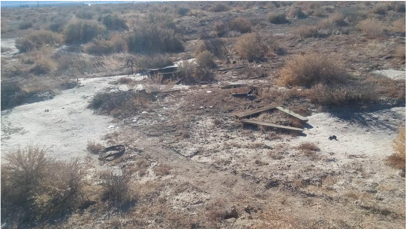
Figure 7 Site D&D-2, View to the Southwest