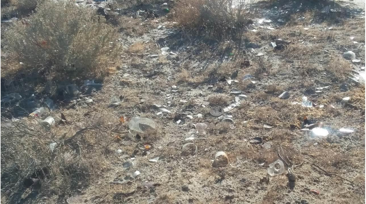
Figure 9 Site D&D-3, Dense Concentration