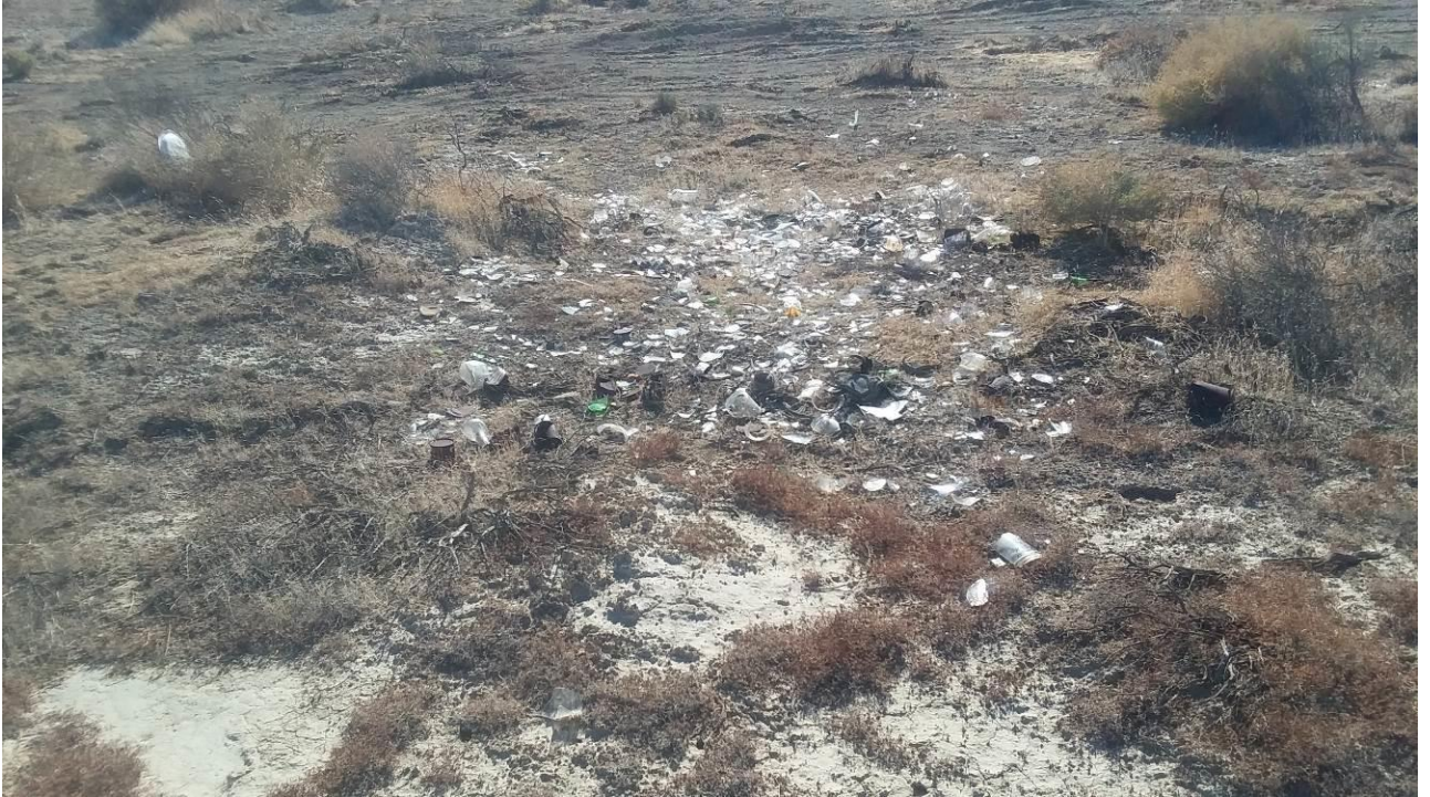
Figure 4 Site D&D-1, View to the East

The largely domestic artifacts are scattered in a linear fashion through a natural channel. Although, one dense locus is present, the artifacts are largely scattered