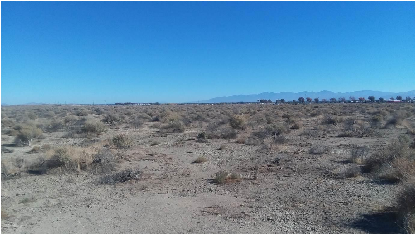
Figure 3 Project Area, View to the Southeast