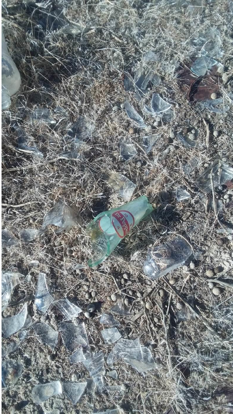
Figure 5 Site D&D-1, Close-up on neck of 1930s Dr. Pepper bottle