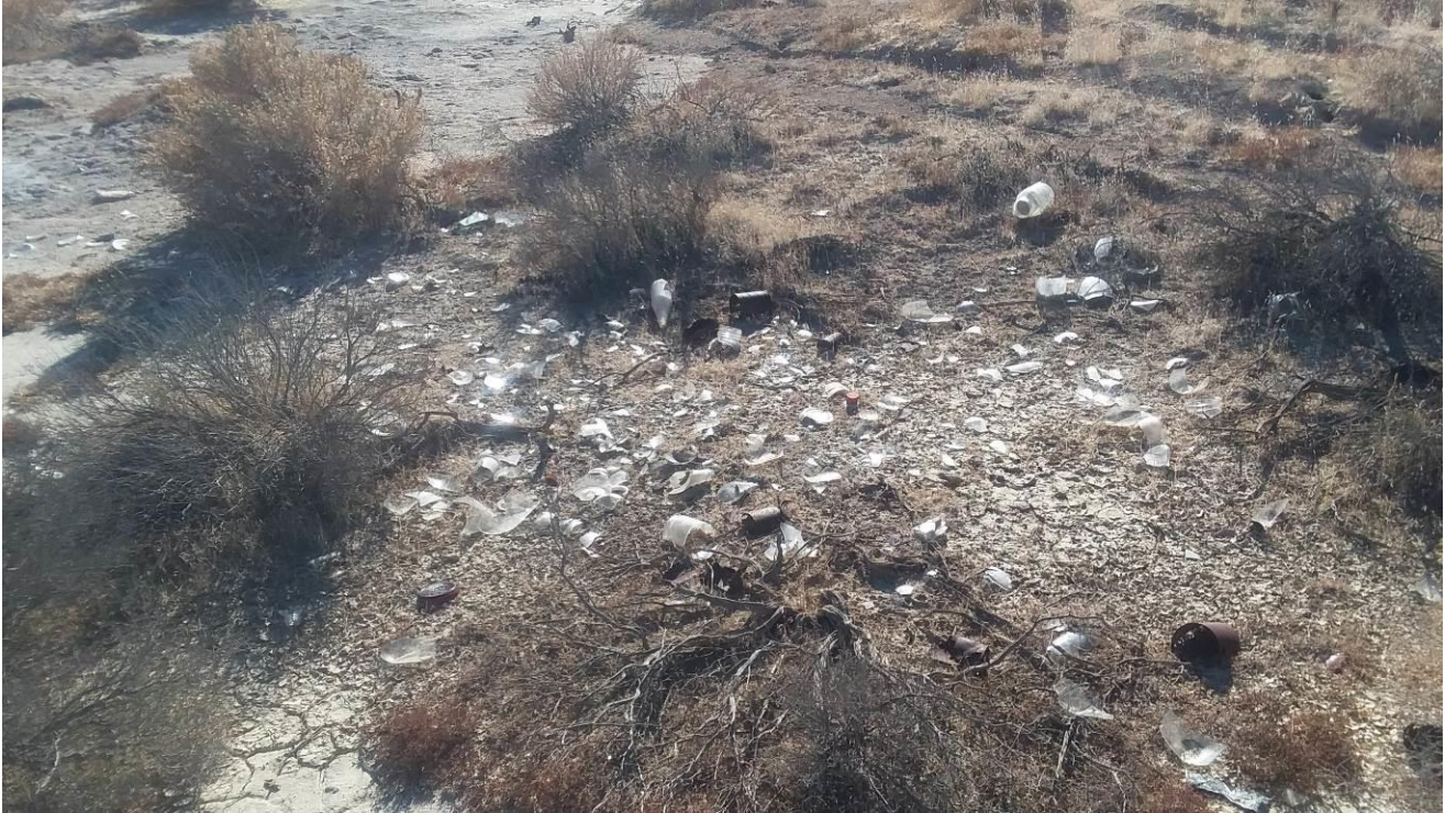
Figure 6 Site D&D-2, View to the East