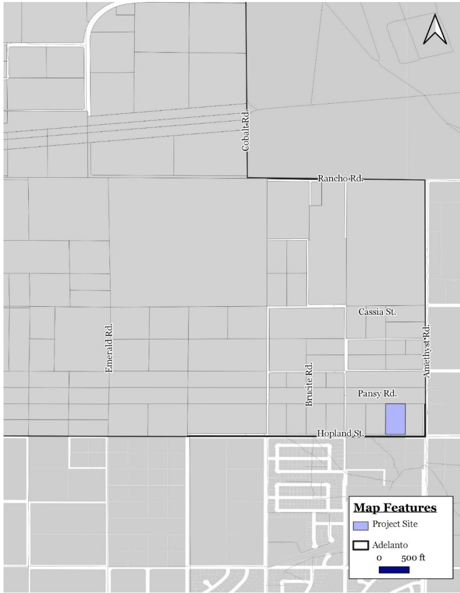
Figure 2: Project Site Location