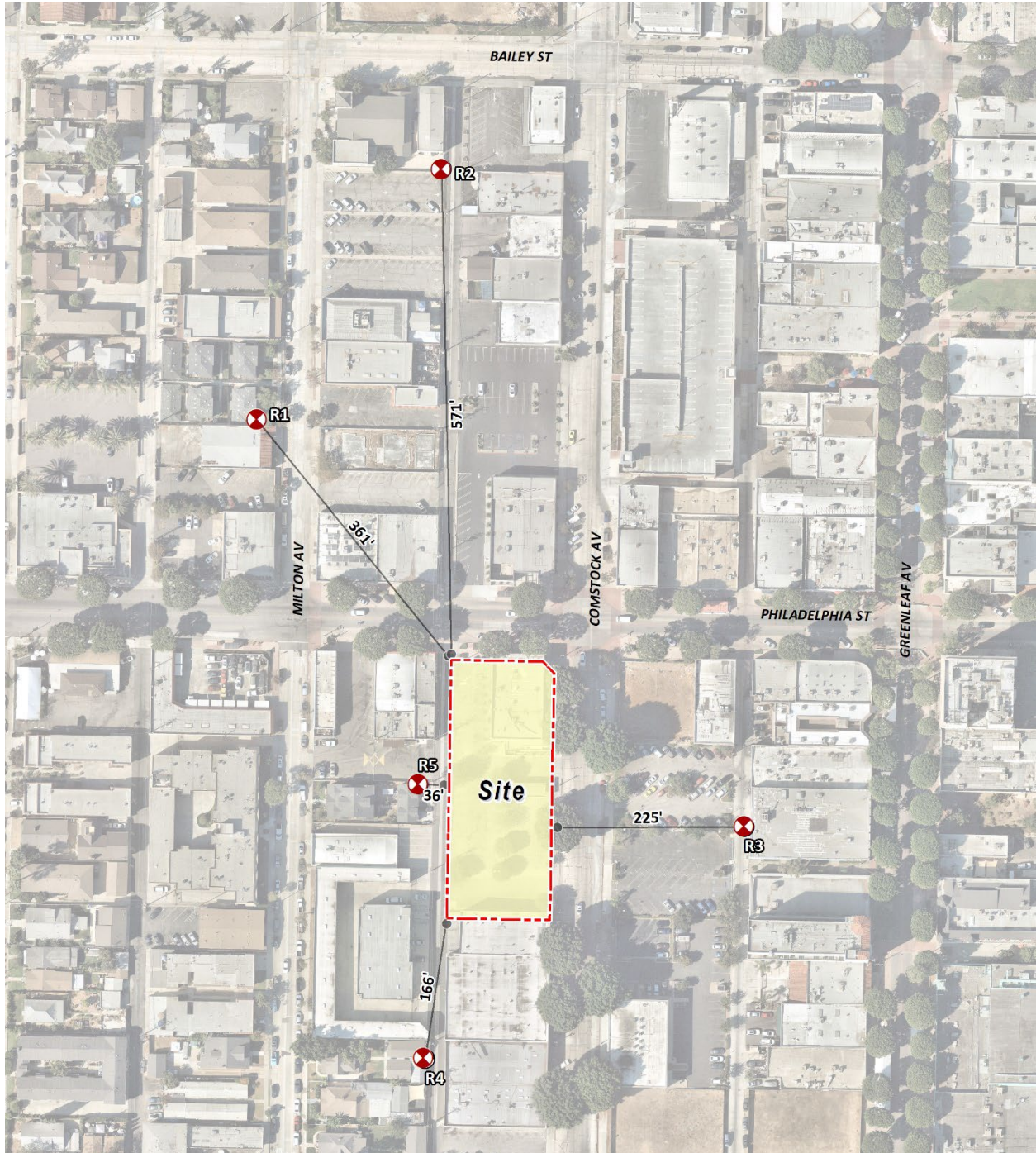
EXHIBIT 3-A: SENSITIVE RECEPTOR LOCATIONS