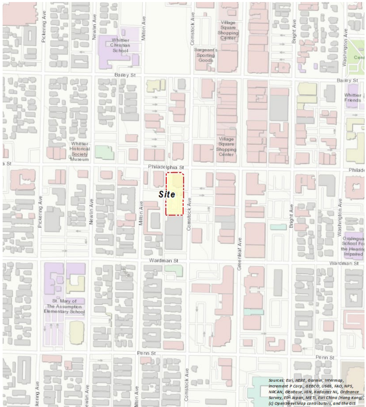
EXHIBIT 1-A: LOCATION MAP