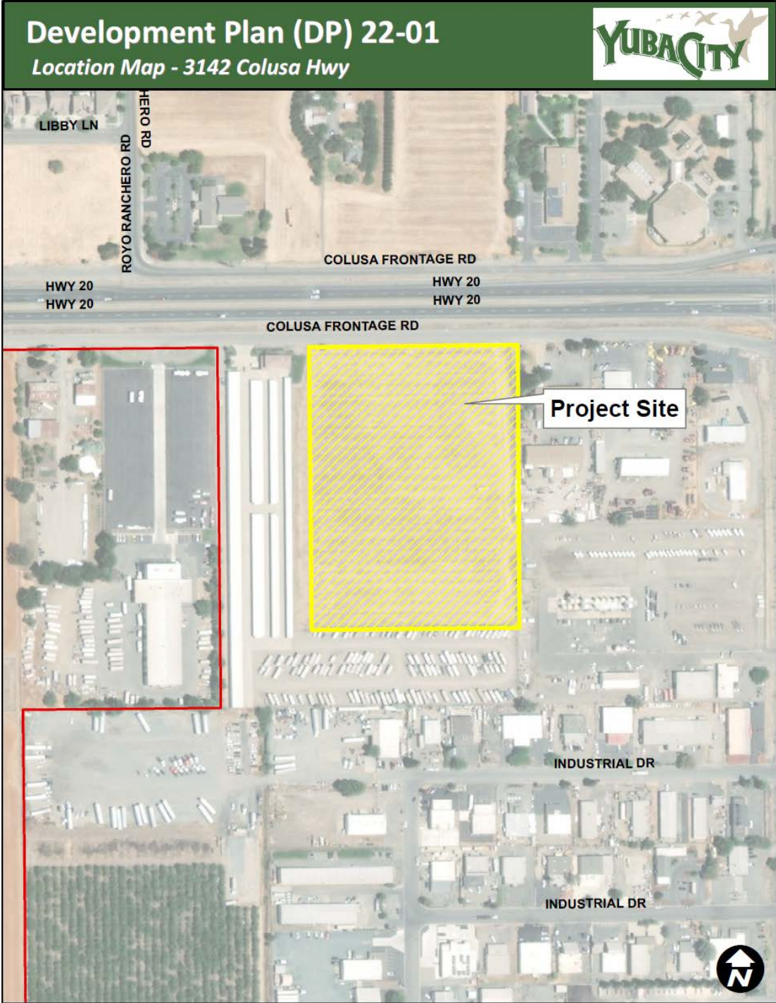
Figure 1: Location Map Development Plan 22-01: Yuba City Self-Storage